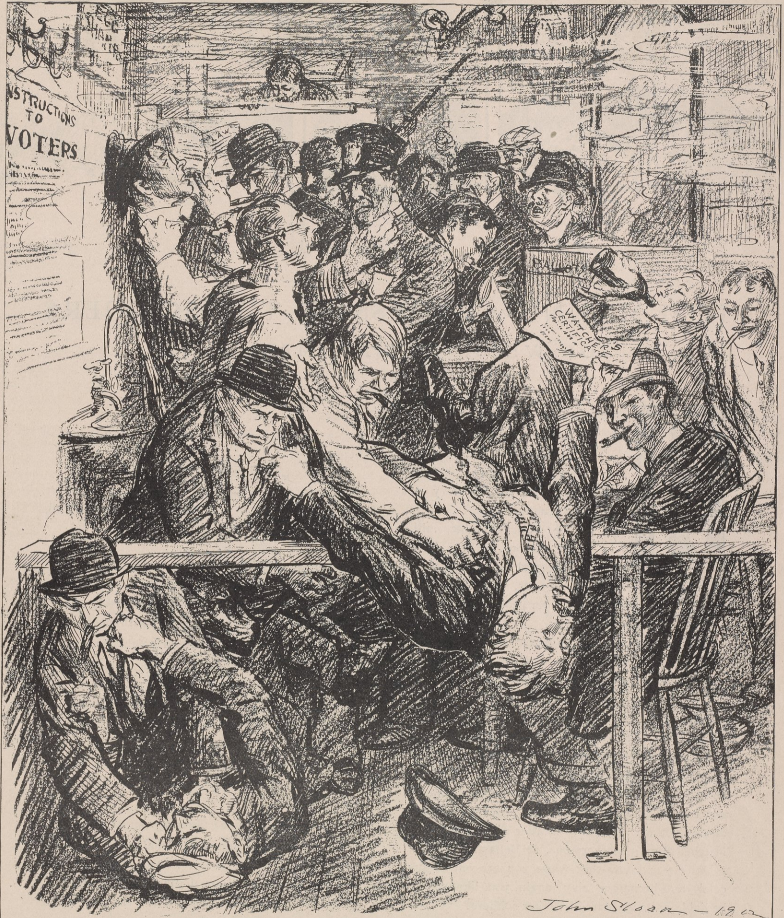
Drawn by John Sloan