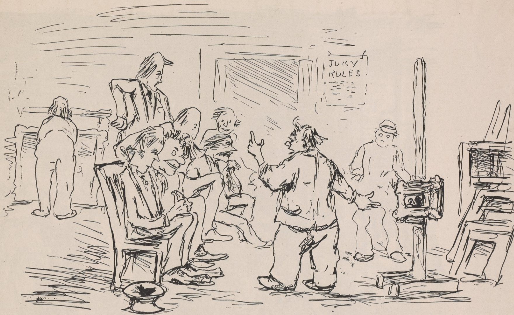
Drawing by Robert Henri