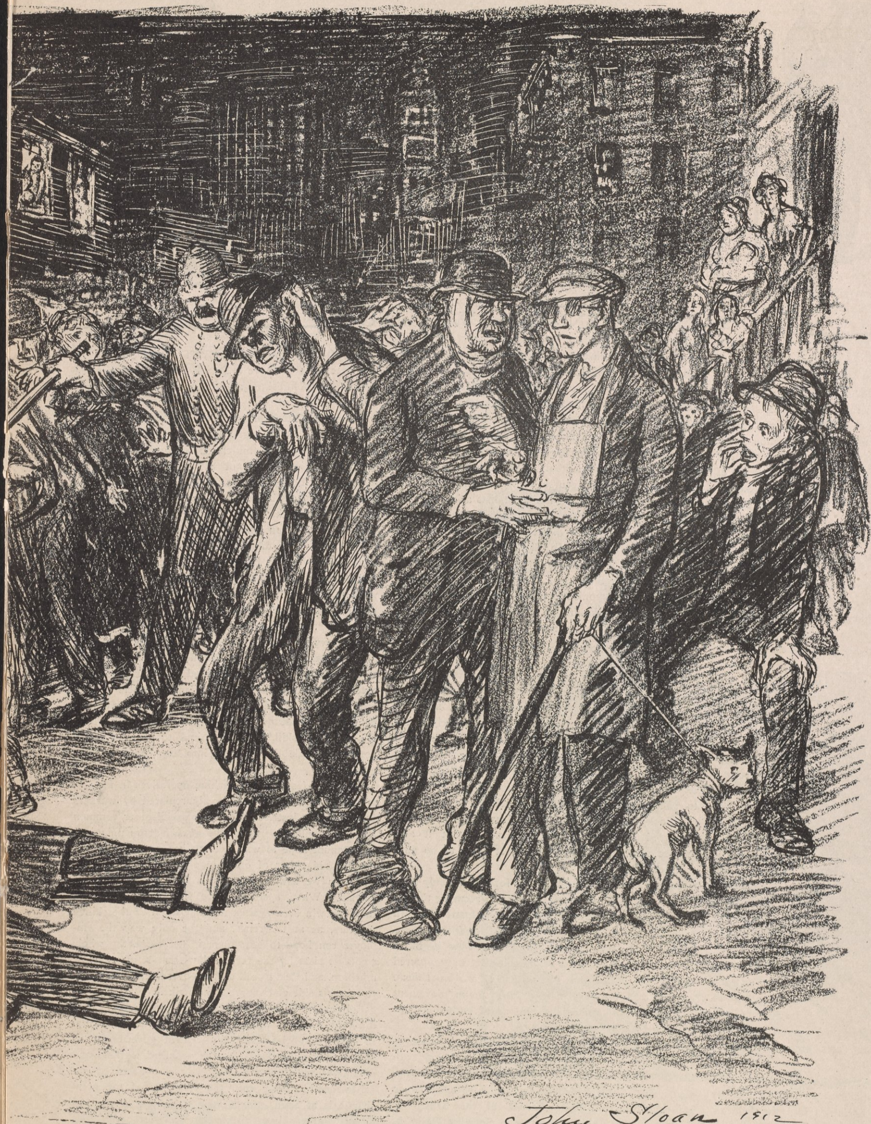
HE Do It?