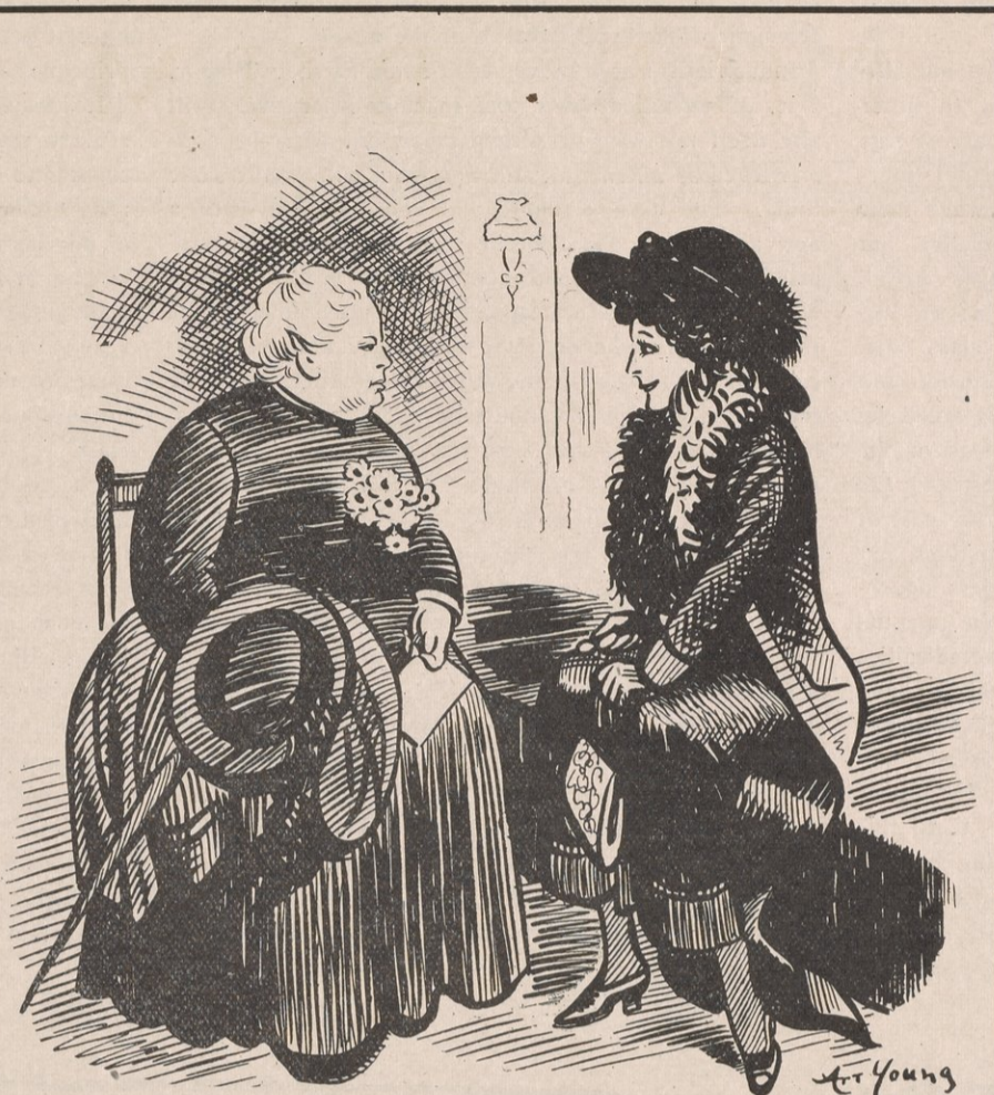
Drawn by Art Young.

Ill-fed, ill-kempt, and ill-clad boys and girls work days, and sometimes nights, for weeks and sometimes months, making cheap fancy boxes, which are later filled with cheap fancy candy, and given to them from some Christmas tree! It is all a game of give and take. Give something you can ill afford, get something you don't want. If the motive behind all this ridiculous celebrating were not partly good, it would be a crime whose effects were past computation, because for every little touch of good, real good and real, true