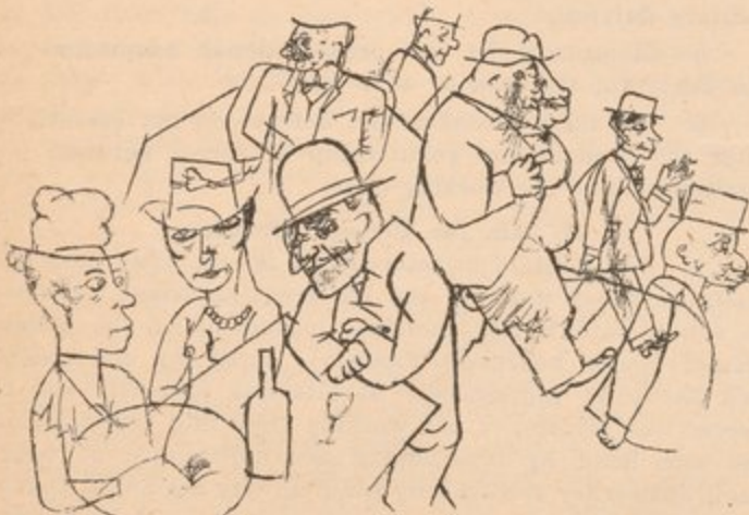
Cafe of the Schiebers

(See the Theses of the Left Wing in next column.)