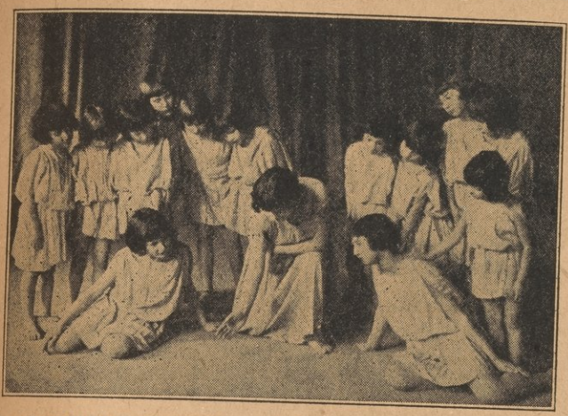
Russian Children Rehearsing at the Duncan School in Moscow.