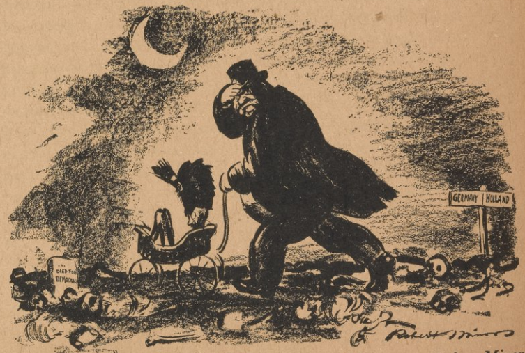
The War Baby: the Crown Prince returns.

From one of the field marshals in the high command in the Democratic Party I have learned that the Democrats will be interested only in politics in the coming sessions. They will not play with the progressives whom they sometimes call "revolutionary radicals". The Democrats will sit back and laugh every time a Republican window is broken on the right or the left. Scandal mongering will be a Democratic specialty. The Teapot Oil Dome theft, the Veterans' Bureau exposure, the non-enforcement and violation of the Meat Packing Control Act and the appointment of Ex-Governor Davis as head of the Reclamation Ser-