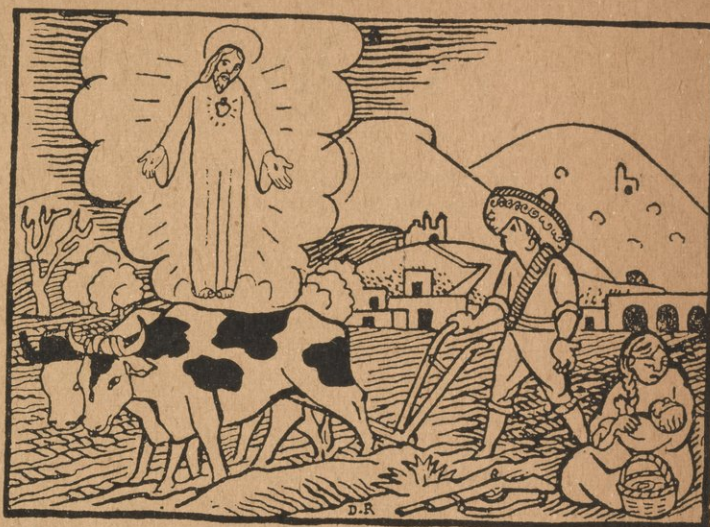
Cartoon drawn by the painter Diego Rivera: Jesus telling the peasant to take the land.

"And even though to men of false and superficial culture these Indian races and the mujik appear primitive and savage, in reality they are profoundly civilized—that is to say they are capable of harmonious relations between men and men, and between men and the earth. They are people capable of living and producing with beauty and order, and in consequence able to receive the true culture, the newest culture, which may be successfully grafted only upon an already cultivated plant. So it results that the Indian man or woman of Yucatan is civilized, while a bourgeois man and woman, creoles of Mexico City, are absolute barbarians, and the case would be the same were they natives of New York. Indeed the ancient civilizations have enabled their races to persist despite the false bourgeoisologist at Harvard University, Central America and Mexico were the home of one of four independent early civilizations, a civilization based on corn, whose people have left civilization which has just gone bankrupt with a human sacrifice of forty million lives—proof of barbarism greater than the world has ever seen."