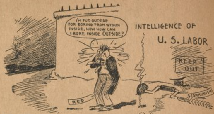
The Chicago Daily News expresses its solidarity with Gompers.

Mr. Gompers won, not a hundred percent, but a thousand percent. But what is the total result?