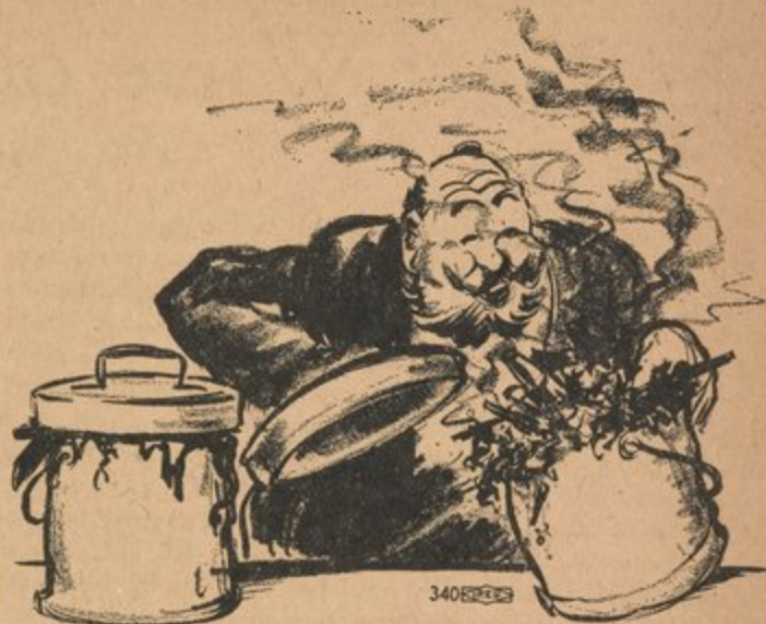
Same Diplomat: "Ah m-m, this is fine!"

for deterioration, and that all workers, including the managers, get proper compensation for what they put into industry."