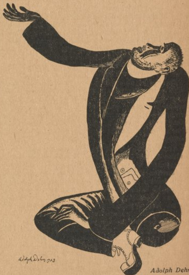
A Beggar in Vienna.

Mexico has been recognized—but not for Mexico's good. With greater and greater quantities of American capital pouring into the country below the Rio Grande, we may be sure that Wall Street will try to rule Mexico politically as well as economically. Mexican workers will be exploited more intensely than ever before. The law will be turned against them and their Constitutional privileges will be annihilated. Mexico has been recognized and the revolution is at an end! Already a new movement is arising in its place.