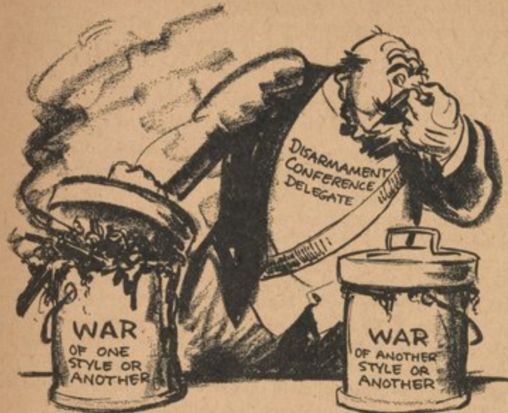
Diplomat: "Oof! This is awful; abolish it!"