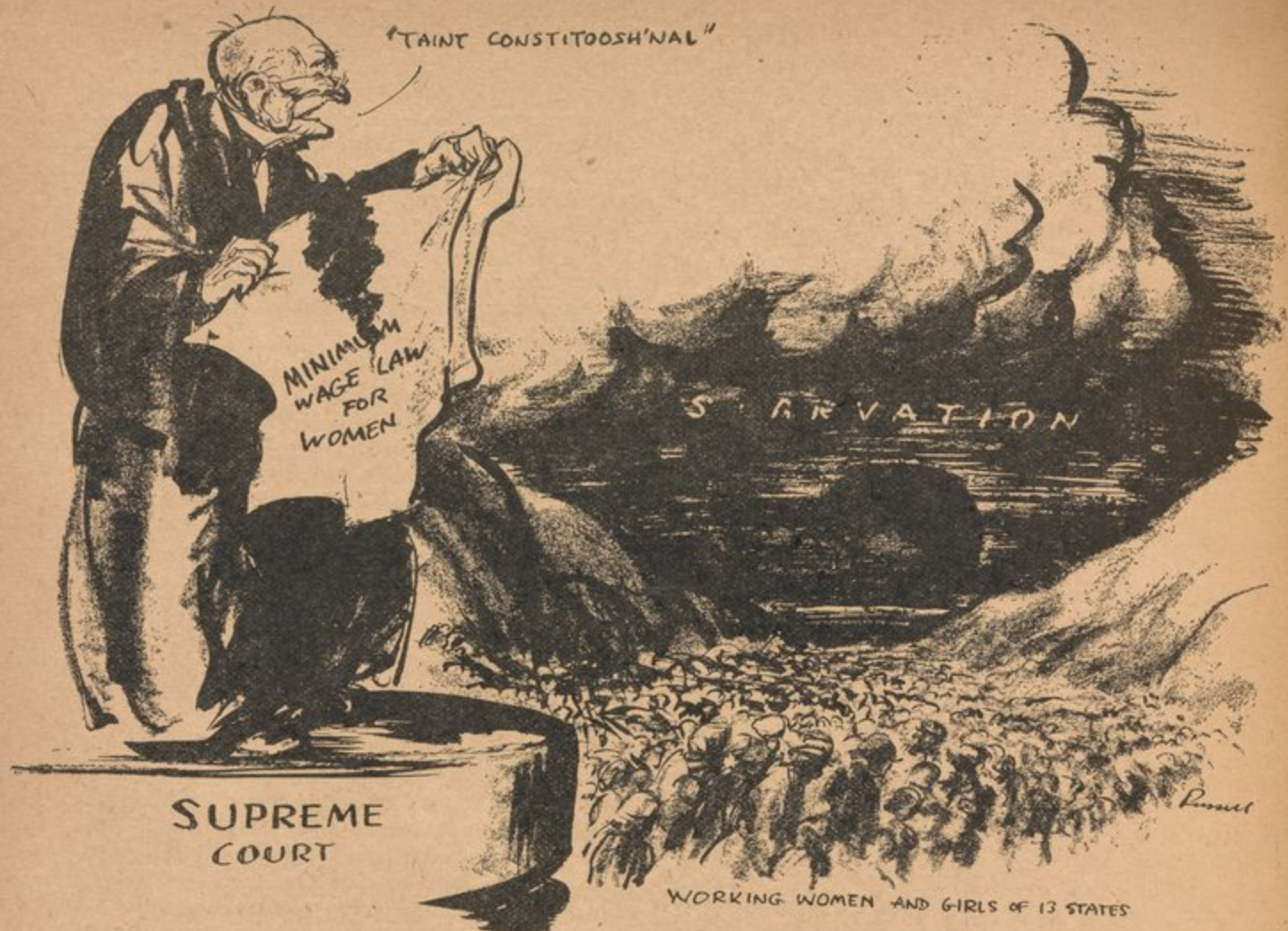
"To Hell wit' 'em; they ain't got no rights!"

ism and competitive imperialism, and the questions they bring up cannot be solved by wars or by conquest. If they could, they would have been completely solved in the World War, because it was a great, sterile military triumph. The conquerors did everything that a conqueror could do. Has that brought about economic peace in the world? Not at all. You cannot beat up the rest of the world and thus make the economic system run. It depends on credit and credit cannot be coerced.