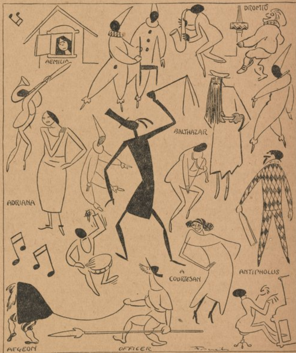
Ethiopian Players in "Comedy of Errors"

Not that I cared! Shakespeare's comedies have no high place in my affections. If the Ethiopian players could make this stale old comedy funny , they would have accomplished more than any white actors I ever saw. And they did. That comedy is a piece of clowning or it is nothing; the clowning, in contemporary performances, is generally neglected, and so it is nothing. But the Ethiopian players gave it as a piece of clowning, and miraculously it lived! I had never thought the speeches of the two Dromios amusing; and I