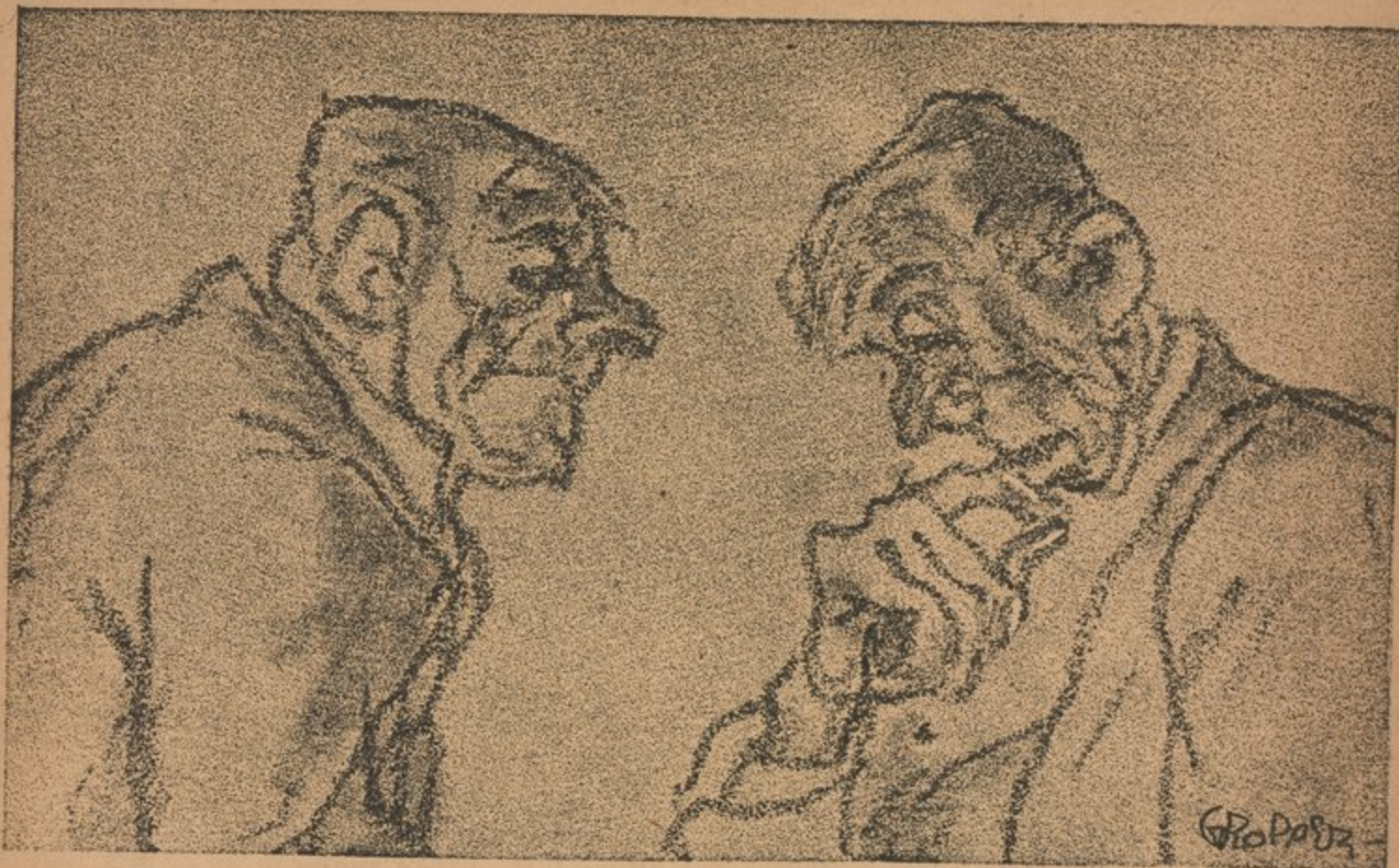
Italian Bourgeois: "Eh, Padre, national glory is fine, but what if that mob asks Mussolini for the cats—?"

dictatorship and does not want to; and we have another (the bourgeoisie) that would like to establish a dictatorship, but cannot."