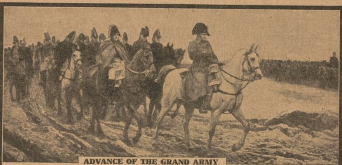
ADVANCE OF THE GRAND ARMY

NAPOLEON'S name fills more pages in the world's solemn history than that of any other mortal. The advance of his Grand Army into Russia is the turning point of his career and marks the beginning of his downfall. During the World War mighty armies marched over the battlefields where Napoleon fought over a century ago. All the causes of this mighty struggle may be learned from the pages of history. The one complete, accurate, authoritative and reliable history, containing the rise and fall of every empire, kingdom, principality and power, is the world-famed publication,