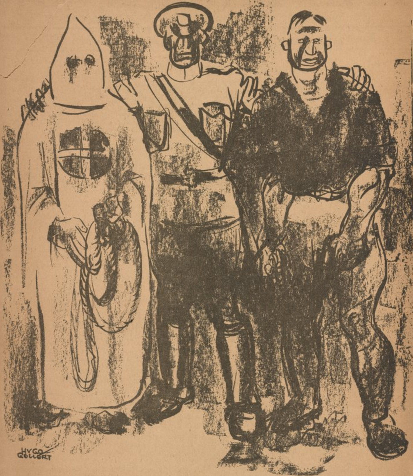
"Mussolini, We Are Here!"