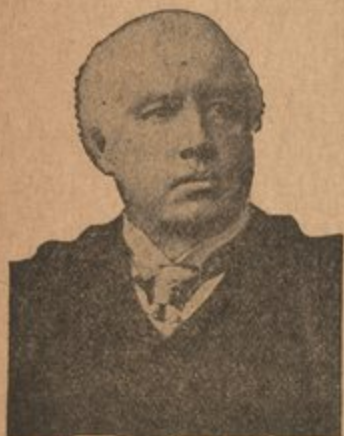
Col. Robert G. Ingersoll

T HE press, the pulpit and the public acknowledged him to be one of the greatest thinkers and orators of the age. Millions flocked to hear him. No building, no tent, no temporary meeting place, was big enough to hold the audiences that crowded, and sometimes packed and jammed the streets, anxious to hear him. Why? What did he say that spread his fame like wildfire? What was the beauty of his expression. What was the charm of his thoughts? What was the magic of his ability to sway men's minds? Why was he sought by the greatest men of his time to speak for their cause?