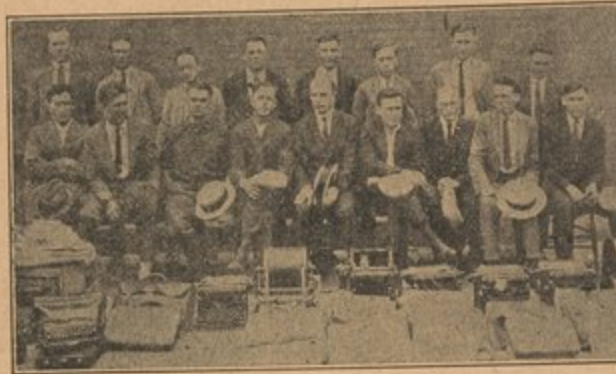
Some of the twenty on trial for trying to use their right of free speech

ON CHRISTMAS DAY in the year 1620, a little band of Pilgrims landed at Plymouth. They had fled to this country to escape persecution for their beliefs. They suffered untold hardships and often "they knew not at night where to have a bite in the morning." Here they sought to establish a community which would not persecute men for ideas, but which would guarantee all men the right to "life, liberty and the pursuit of happiness."