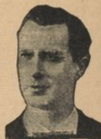
Brann, the Iconoclast

But—after three years of kitchen slavery, after three years of blows and reproofs, her appointed guardians threw her out into the street branded as a Magdalene. They called her a woman of shame. But Brann, the Iconoclast, called it "the most colossal crime of the age!"