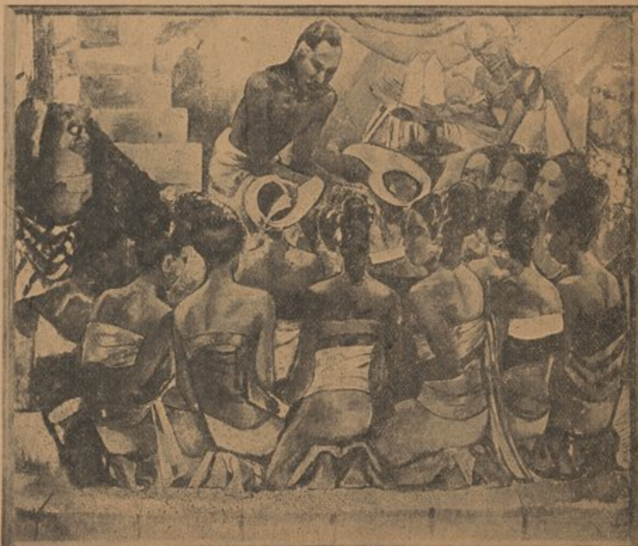
A Drawing by Maurice Sterne

"I think it is best that we sell the restaurant out, Martin," she began. "If I felt you were getting fed up, that you really wanted to hurt me, I would leave you. But I don't feel that way, and you don't act that way, either. And it seems I could stand for anything, except your being with those brazen women, yet you're so good about everything else but that."