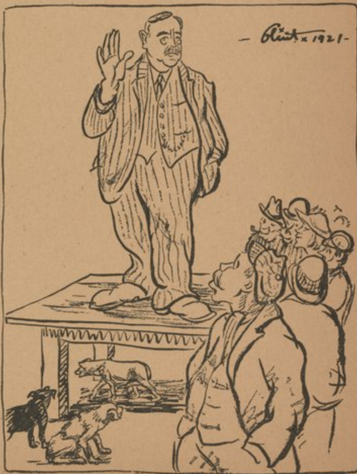
Arthur Henderson, Labor M. P.