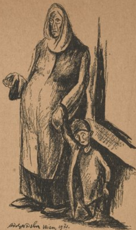
"Please Give For the Future!"