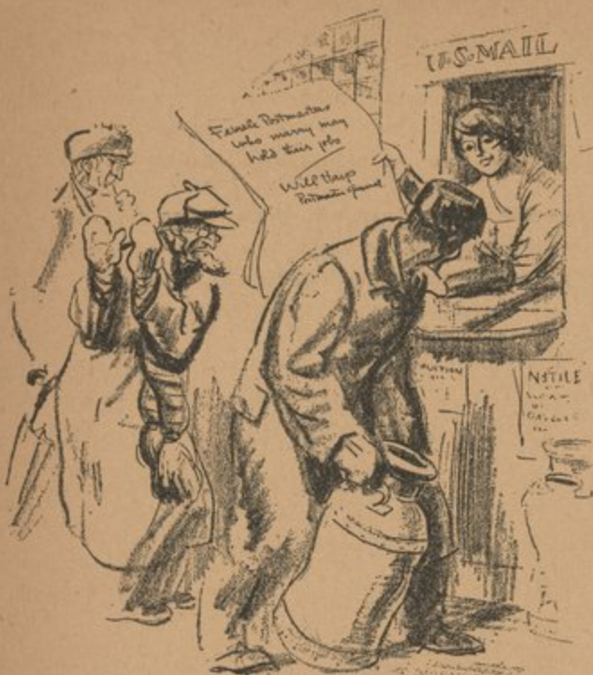
A Blow At Birth Control