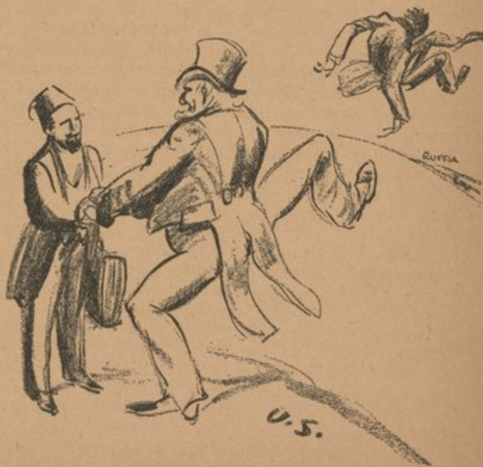
Soviet Envoys: For Persia the oily palm, for Russia the gate

Years ago he placed himself in the center of a group of homeless migratory workers; he framed himself with bread-lines of men. But now the frame is walking away with the picture.