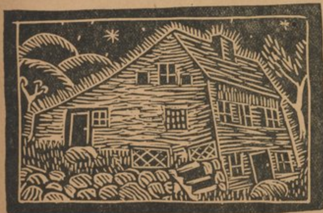
From a Cut by Ilonka Karasz.