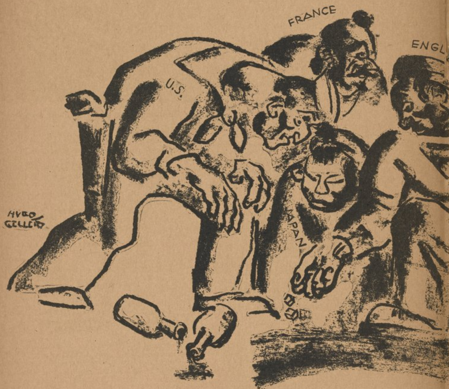
The Conference on I...