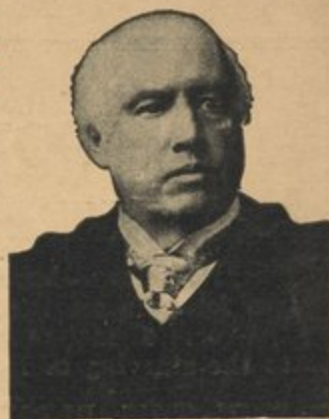
Col. Robert G. Ingersoll

Is there a God? Is there a Hell? Is there a Heaven? Are we better than the Savage who worships an Idol? "Prove it and I'll believe you," cried Col. Robert G. Ingersoll. But they couldn't --or wouldn't. So they cast him out. They hated him. They fought him. But for fifty years he fought back. Never could they batter down his logic. Never could they answer with reason.