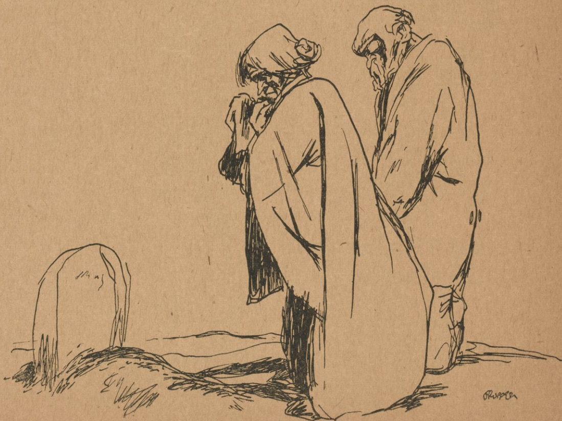
An Unknown Soldier

Take H. 3d, for instance. In the old criticism there were no H. 3ds. A critic might be married; he might have a child; but what had that to do with the business of criticising