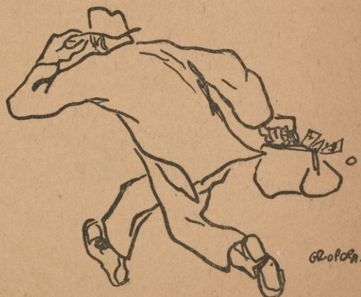
Rear View of the Author of "The Socialization of Money," bound for some place

Does it all sound dull and technical, brother millionaire? Does it sound like a poor sort of medicine for the jaded emotions, sick of this brutal, chaotic, war-racked world? When a man's body is sick, a doctor is called in, a dry, emotionless technician. He knows his job. The leaders of the revolutionary working class know their job. They know that there is hope for America, for the world. The future is in their hands, their strong, capable hands, their sane, shrewd brains, their warm hearts. Let us help them all we can as we wait and see.