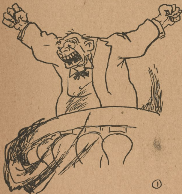
Before the war this guy stood on his veranda and cheered his head off for the boys going to the front—

No, I live in no cheerful world; nevertheless I live in a hopeful one. The world of labor is built on foundations of despair, but its columns and pinnacles are of strong granite hope. What keeps me sane is that I have studied a little in Marx, and have thrown myself a great deal into the dangerous whirlpools and rapids of the labor movement. I can be gloomy, tired, bitter, sordid, selfish, cynical and disgusted with the world, but I can never despair. I know too much for that. I know that there is something greater than myself and my moods that is making for righteousness; that it is greater than all the moods of all the men in the world; that we can grow tired and old, corrupted and melancholy, but that the great thing will always be there. It will always be there while capitalism is there; it is the modern labor movement, that has been created by capitalism, and that by the laws of capitalism must go on fighting for its life, fighting on the defensive against the beast that is ever-hungry, fighting because it must conquer or die. And it will conquer, for the war spelt the failure of capitalistic production, and with its conquest of the world, labor, which is communistic, will replace capital, which is competitive, and