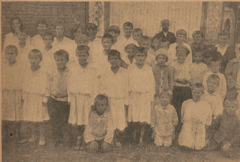
Soviet Station for children at Syzran

To the rich and the privileged, to those who sit on roof-gardens or ride in parlor-cars, the Revolution is the Anti-Christ. But to the despised and disinherited, the Revolution is like the Messiah "coming to proclaim release of the captives and to set at liberty them that are bruised." No longer can Dostoevsky's convict mutter, "We are not alive, though we are living. We are not in our graves, though we are dead." In the House of the Dead, Revolution is Resurrection.