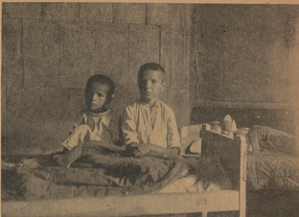
Hungry Boys in Saratov Deserted by Parents

"Already the greedy hands of the Imperialists of the world are reaching out across the seas. Only the hands of the