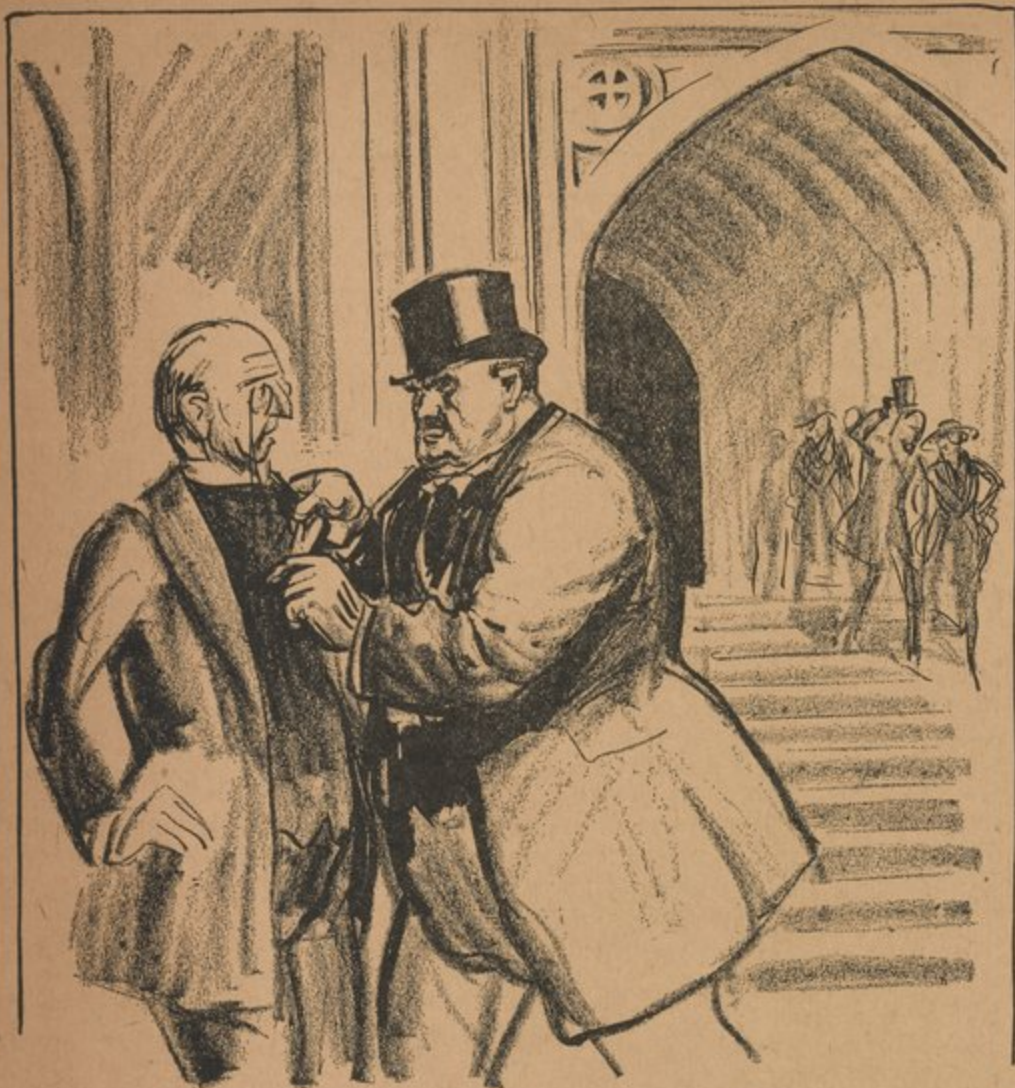
"Lay off Pittsburgh—stick to the next world!"

How trivial the "corruption" that can at best only help to ward off the horrors of starvation, compared to that which opens the avenue of investment, and enables the corrupt and their heirs and assigns forever to sit comfortably upon the backs of the people!