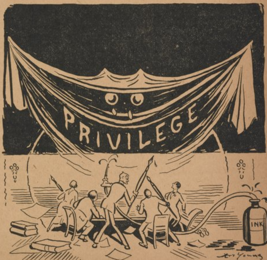
The Freeman Editors' Weekly Attack.

I said, you may remember, that we are distinguished, we literary and artistic people, not by our ability to think, but by our ability to realize—to feel and express the qualities of things. And this faculty of vivid living—"besides the ultimate and absolute value that it has in itself—contributes something indispensable to the practical movement. It contributes something that we might call inspiration . It keeps up a certain warm faith and laughing resolution in those who might weary of learning and laboring in the mere practical terms of the task." Upon the basis of that statement