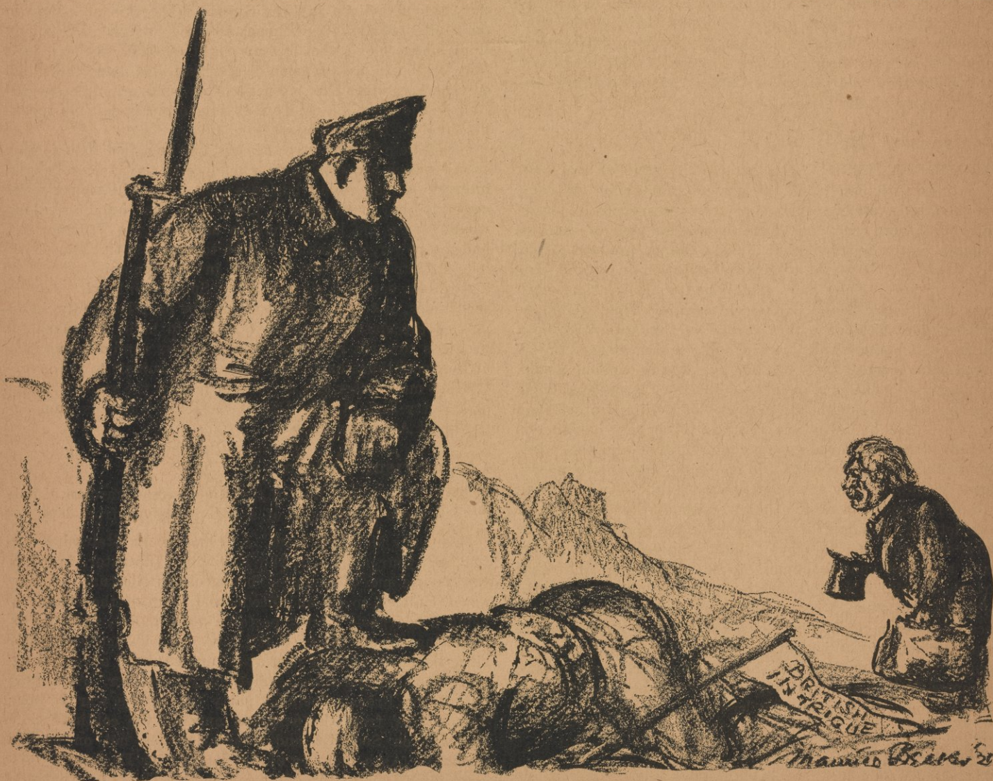
Drawn by Maurice Becker

"In my opinion the religious temper of the Russian Communists is a Russian rather than a peculiarly Bolshevik characteristic, although it seems to be horribly infectious. Equally Russian is the narrow sectarianism that is acting as a solvent in European Socialism. Of course there must be discipline in every party. Complete toleration in a party is absurd, for without some common principle of action it ceases to be a party and becomes a heterogeneous mass incapable of any effective action. That is what the Second International has become. But there is something between the inverte-