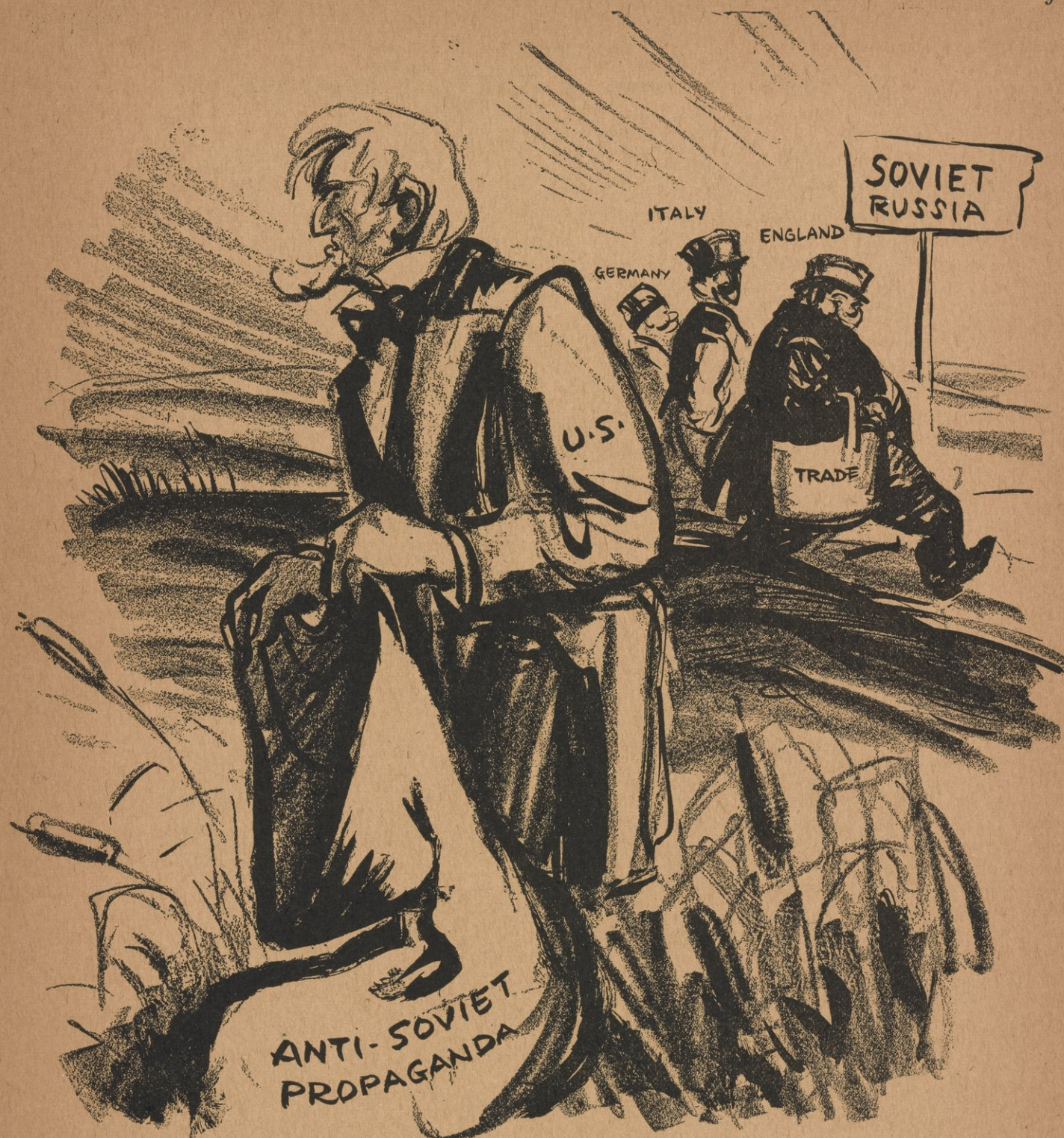
HOLDING THE BAG