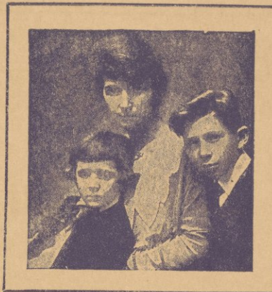
Mrs. Margaret Sanger, the great birth control advocate, and her two sons

ON SALE AT MARX INSTITUTE 134 East 7th Street, and RAND SCHOOL, 7 East 15th St.