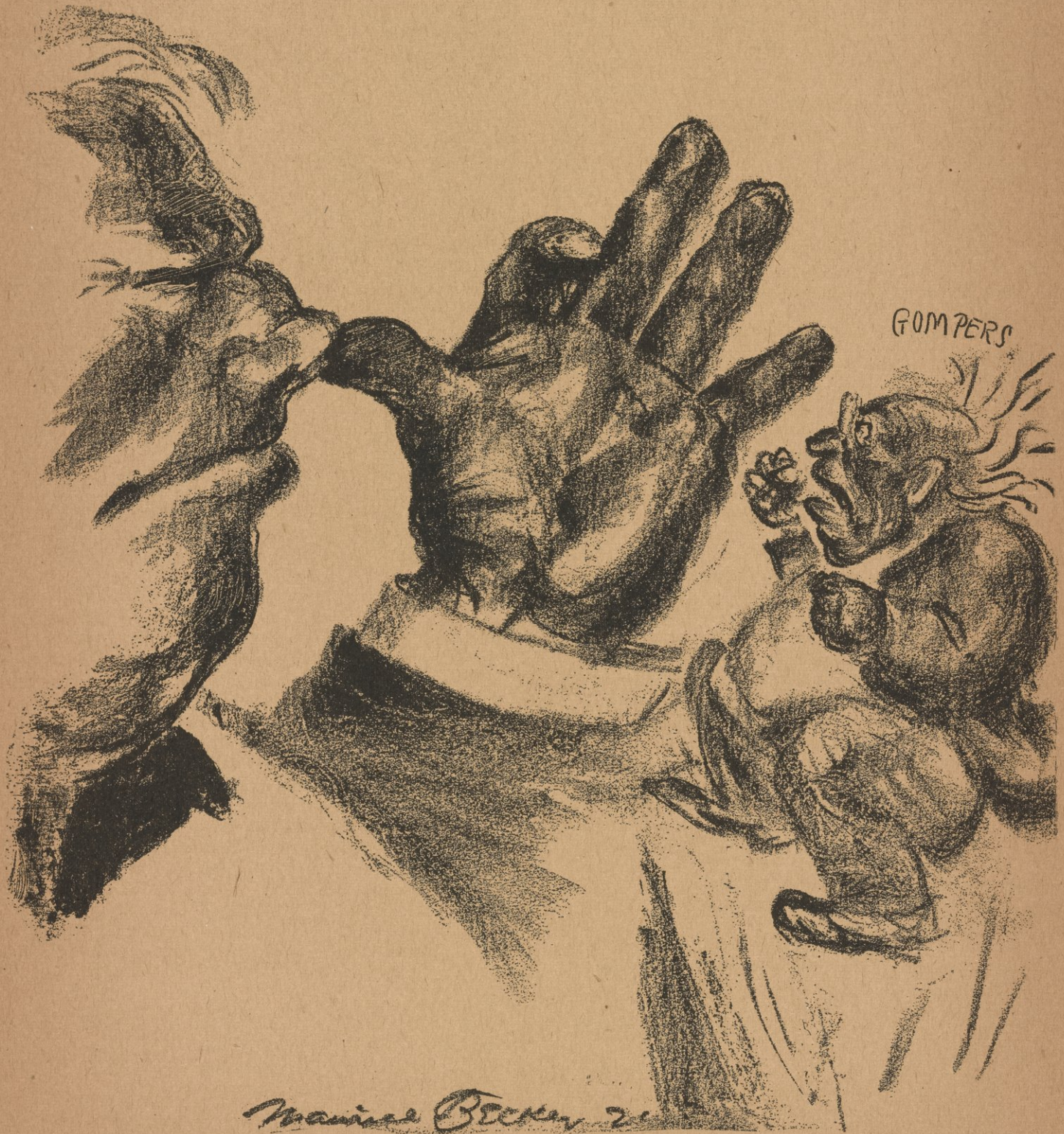
Congress Says to Mr. Gompers--