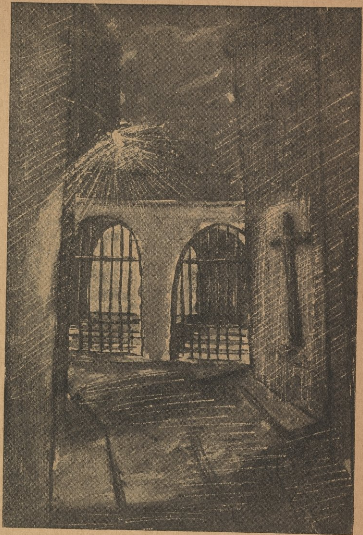
The Black Cross, Toledo

Nacional de Trabajo , the C. N. T., an outlaw organization which recognizes the partial and general strike, sabotage, and secretly organized terror. At present it is split between those who favor the Third International and those who are opposed, not only to political action of any sort, but also to the dictatorship of the proletariat. The organization as a whole does not see its real revolutionary purposes and the struggle has degenerated into brutal reprisal and counter-reprisal.