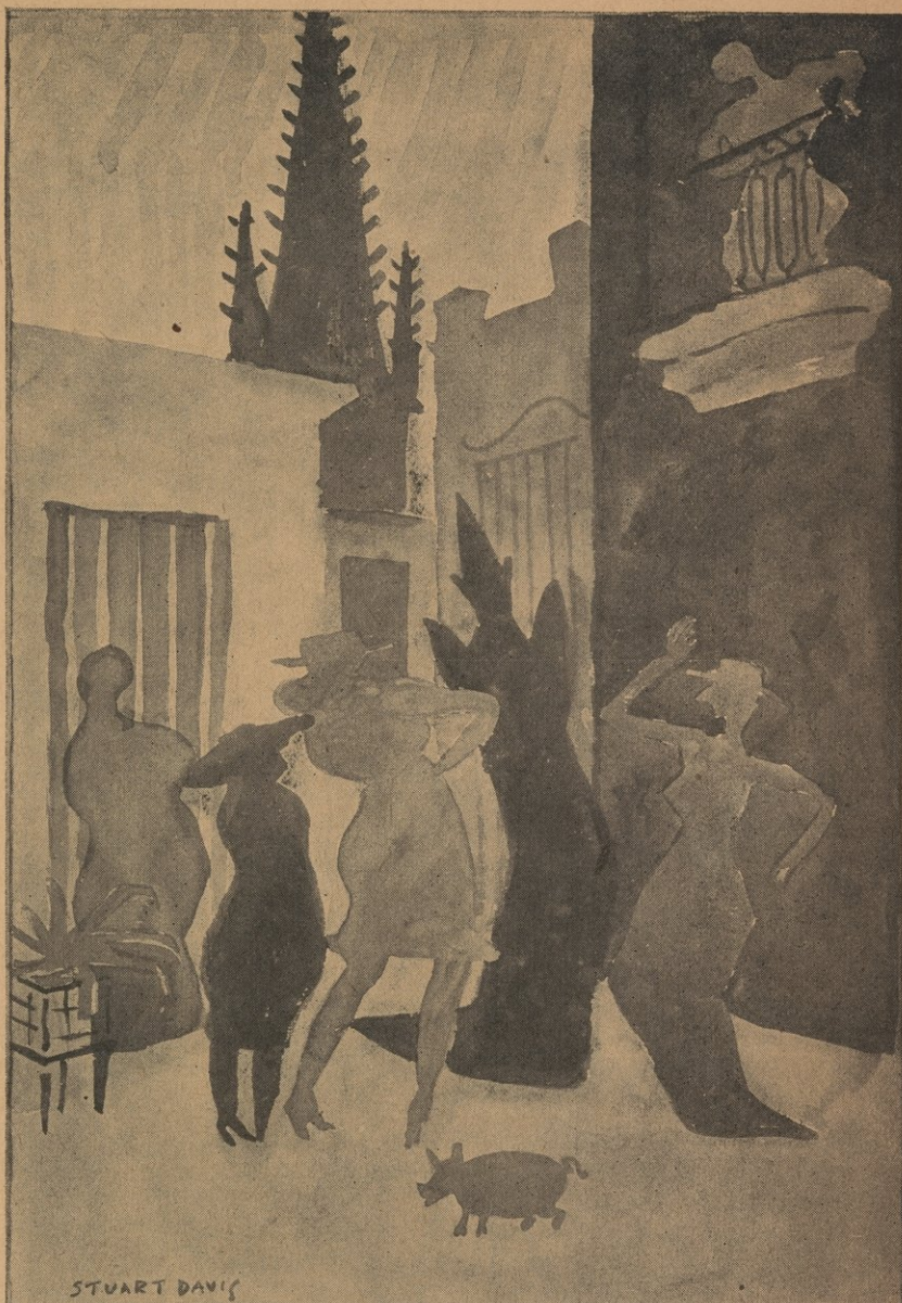
From a Water Color by Stuart Davis.