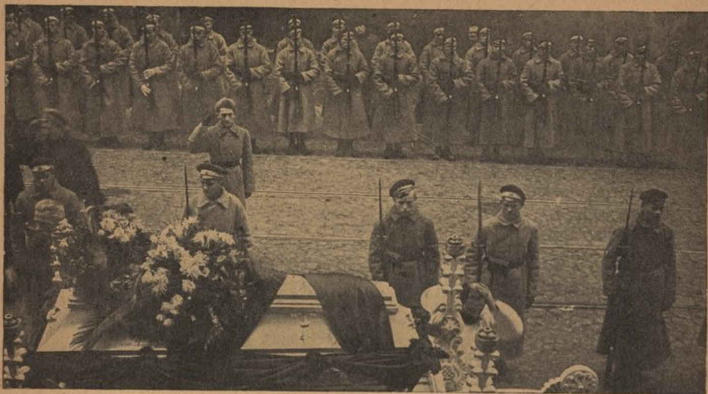
Soldiers of the Red Army saluting their dead comrade from America