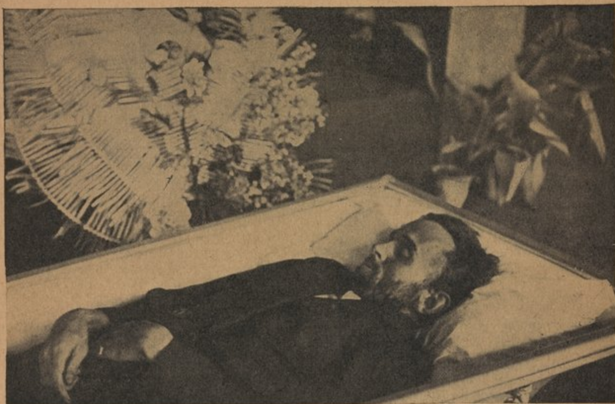
The body of John Reed lying in state at the Labor Temple in Moscow