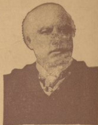
Col. Robert G. Ingersoll

Is there a God? Is there a Hell? Is there a Heaven? Are we better than the Savage who worships an Idol? "Prove it and I'll believe you," cried Col. Robert G. Ingersoll. But they couldn't—or wouldn't. So they cast him out. They hated him. They fought him. But for fifty years he fought back. Never could they batter down his logic. Never could they answer with reason.