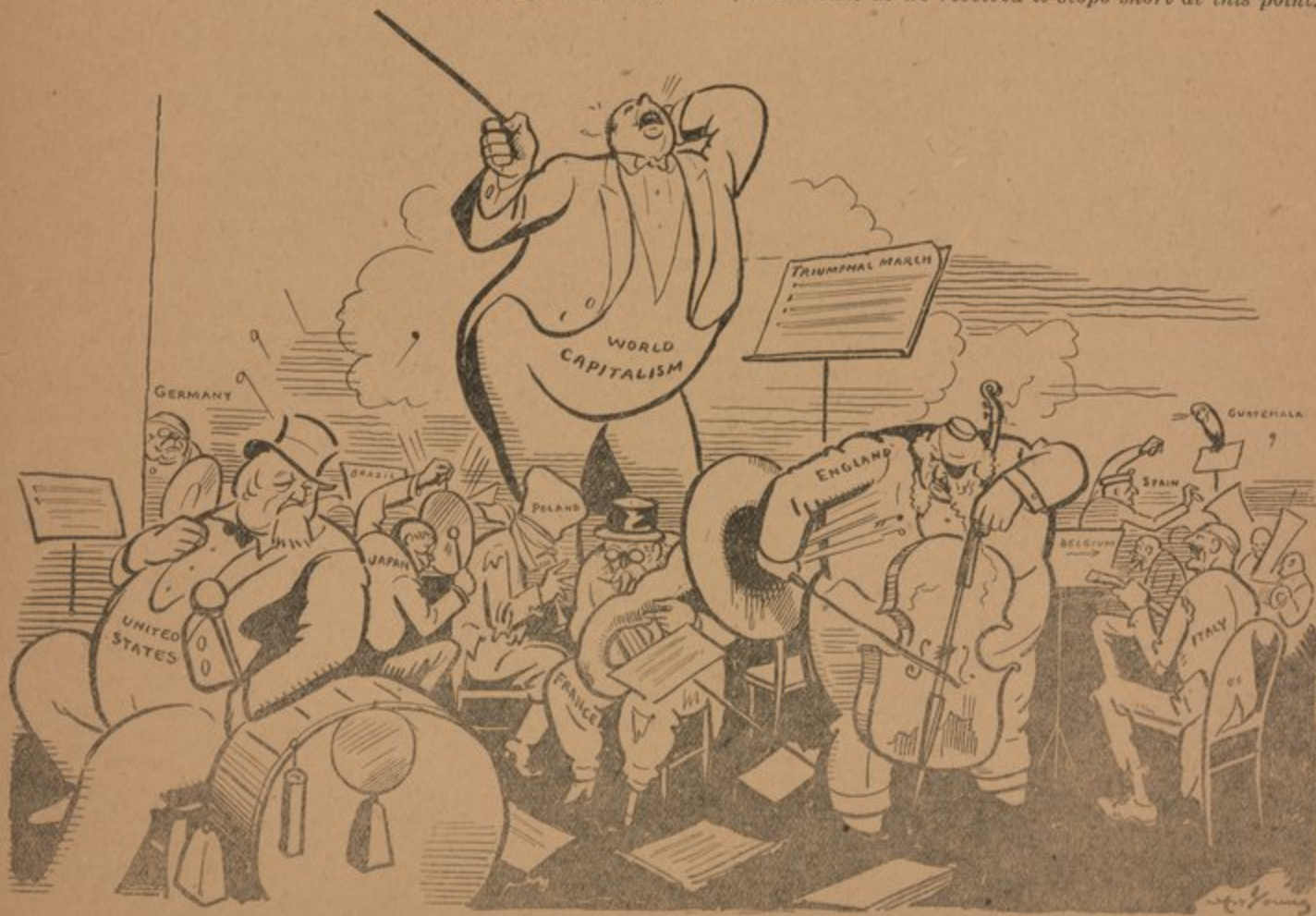
The Concert at Geneva

(This article as we received it stops short at this point.)