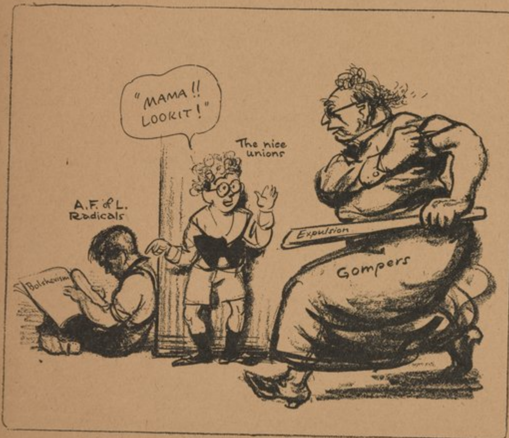
That bad boy reading dime novels again!

The campaign of labor to lift the blockade has begun. It begins, as such a movement must, with resolutions; and with funds, too, in response to Joseph Cannon's appeal. But one young man spoke out the secret thought at the heart of that meeting when he rose and growled: "There are more pigeon-