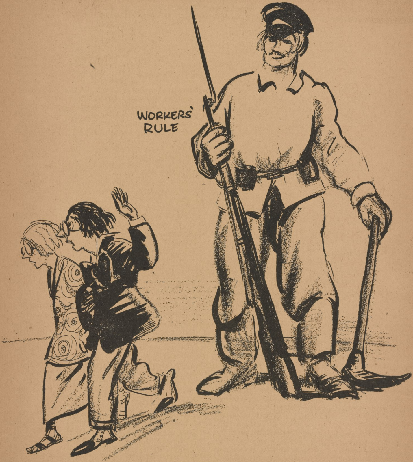
Socialist Investigators: "Horrors! How crude! It's much nicer just to dream about it!"