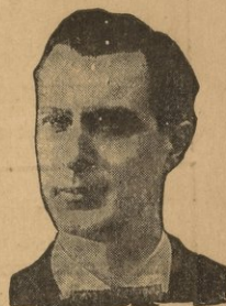
Brann, the Iconoclast, of Whom Elbert Hubbard said:

The world gasped in amazement! Society was shocked at his merciless exposures. The guilty, branded with their infamy, hung their heads in dishonor! They cried out to stop him—they invoked the powers of earth to silence him. Alone he defied the world! Was he master of the passions of men that he could craze with hatred and hypnotize with love? What was his strange magic that held hundreds of thousands spellbound? Why did one man give his own life to take the life of Brann the Iconoclast?