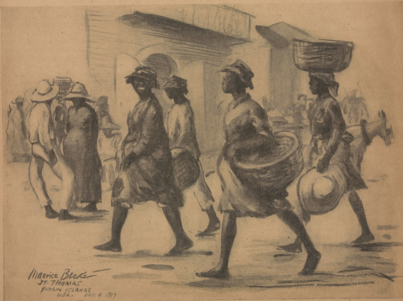
A Drawing by Maurice Becker.