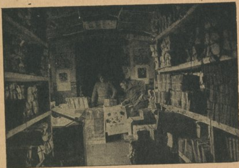
Interior of the Propaganda Train.