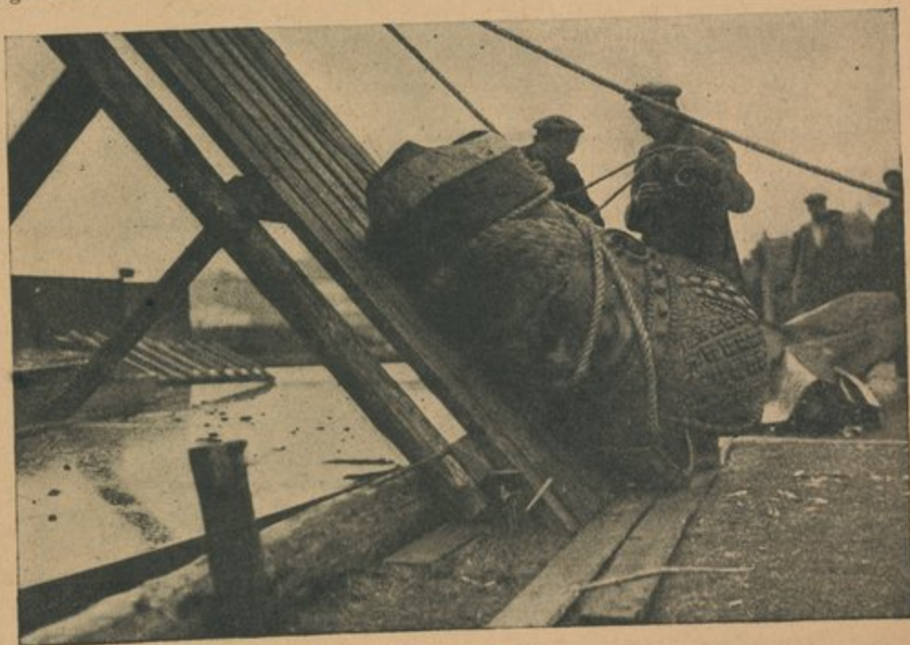
4. How are the mighty fallen!

Q. Should you say that art and literature flourish under the Soviets?