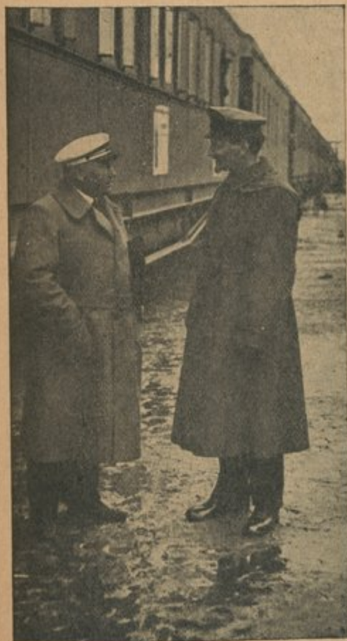
Trotsky conferring with General Vatzetis at the front.

Q. How do you account for the fact that a man like Bertrand Russell did not "see" Russia?