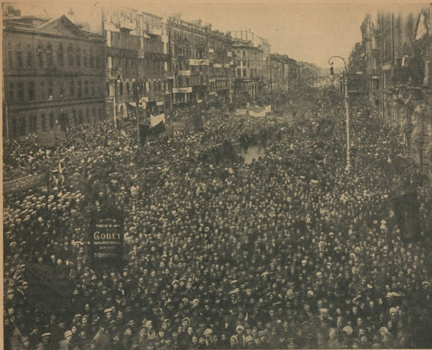
Communists volunteering for service on the Polish front (Petrograd.)