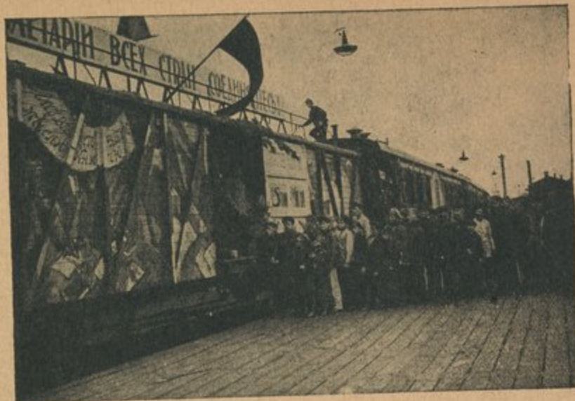
Soviet Propaganda Train stopping at a village.