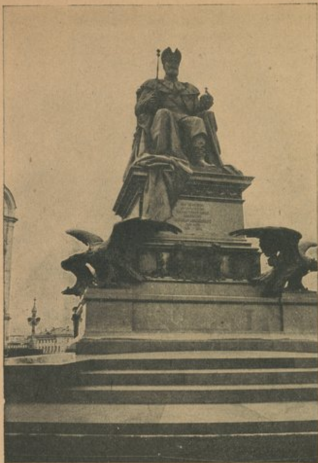
1. A statue of Czar Alexander III—symbol of the old regime (Moscow).

A. No one could understand what has happened except a man who knew Russia before, who knew the life of the average citizen, the life of the peasant, the life of the workingman. Take the matter of profanity. In Russia of the old days, one could hardly pass a street, one could hardly pass a house, one could hardly pass a gathering of three or four men without hearing a constant stream of curses—the most elaborate sort of cursing. But during one month's stay in Russia this summer I did not hear one single man or woman cursing—not one single instance. And I travelled about 650 miles. The trains usually stop at every town and village, and everybody comes out to meet the train. That is an old Russian custom. In the old days the air was always filled with cursing and foul language. To-day there is none of it. Now, that means something. It is indicative of the great moral transformation of the whole nation.