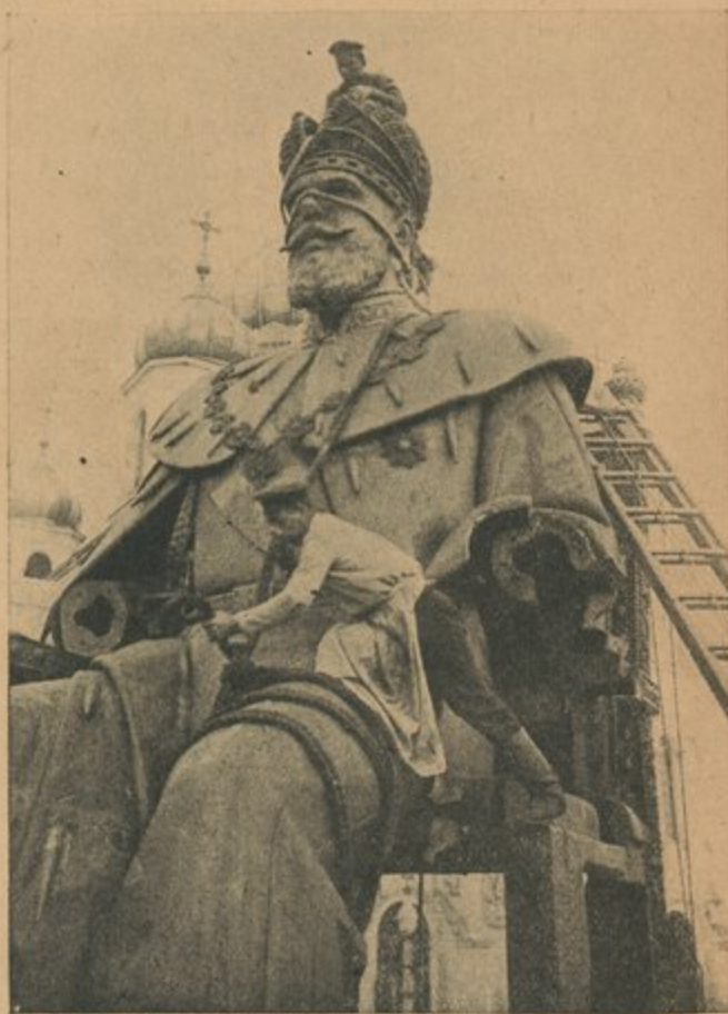
2. Bolshevik iconoclasm gets to work

I have not been a shoemaker myself, but I have to provide