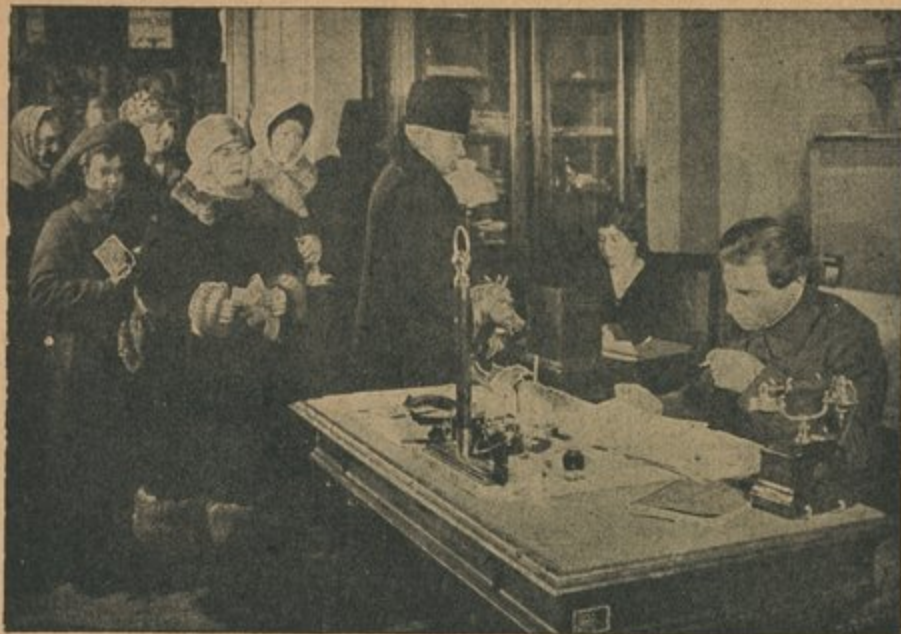
Soviet Labor Registration Office—members of the bourgeoisie applying for work (Moscow).