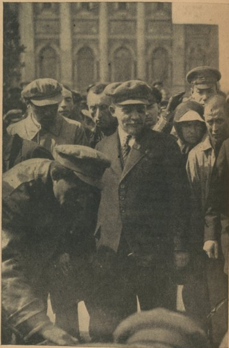
Lenin at the Karl Marx memorial ceremony.

Although himself a severe realist, Lenin is becoming little by little a legendary figure. And that is well.