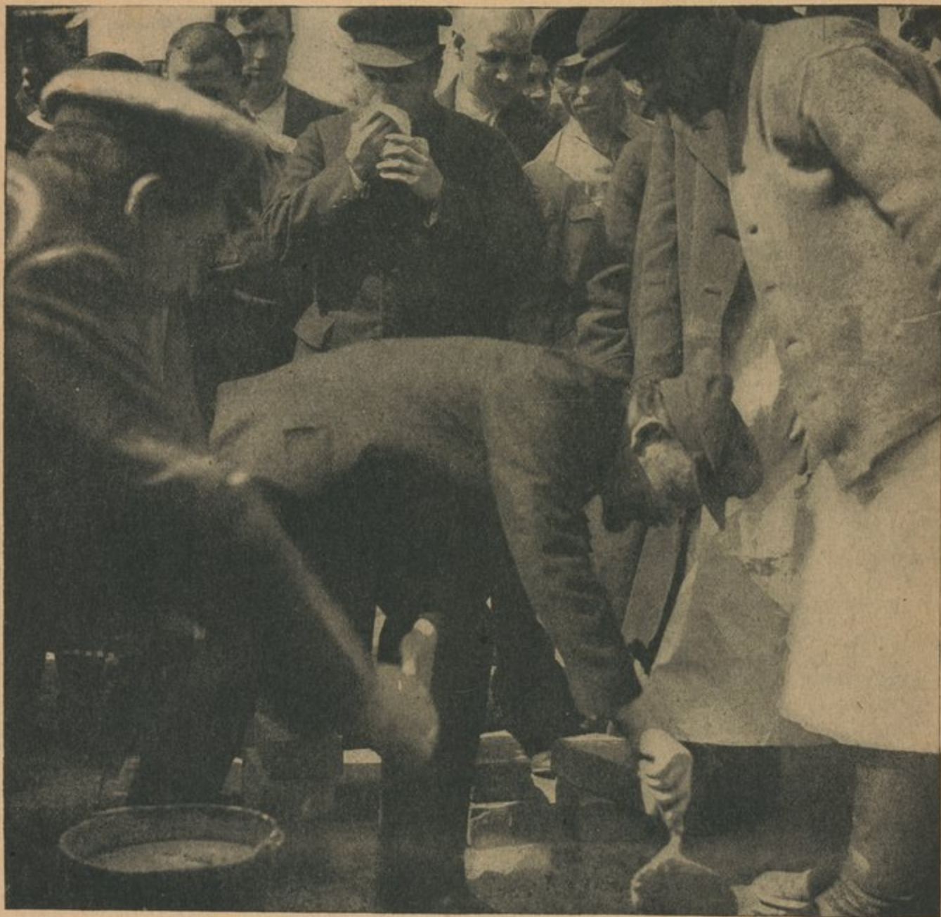
Lenin laying the cornerstone of a memorial to Karl Marx (Moscow)