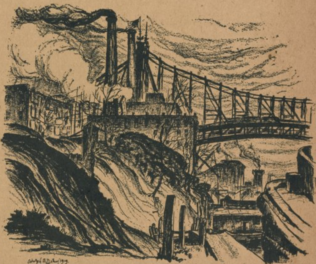
A Drawing by Adolph Dehn.

"I can see us sitting on the deck of the ship—each