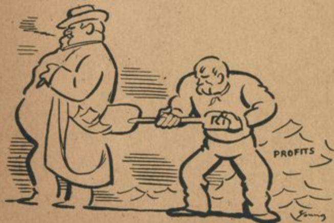
Shovel, you proletariat, the boss needs the money.