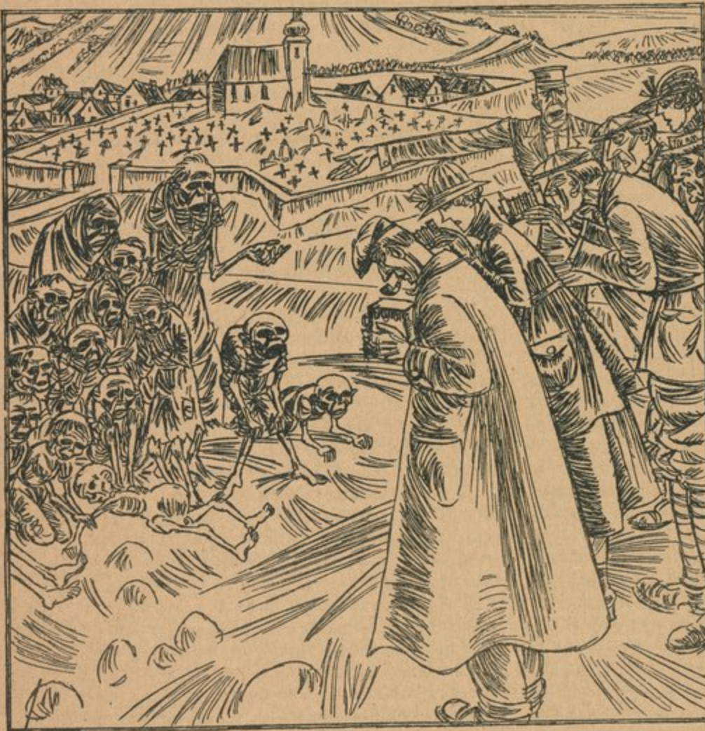
Tourists Seeing the Sights in Germany

Past the parked motor lorries we walked up the main street. A car full of Y. M. C. A. girls and men in uniform came by. "Kee-kee-kee"—"Giggle-giggle."