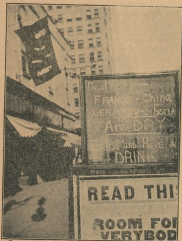
A U. S. Army Recruiting Sign in Salt Lake City, Utah

"As far as Bolshevism goes it can't lose. But the Bolsheviks are another thing. They're suffering and dying—being butchered with our help and by our connivance—and its terrible—terrible—terrible—to think that all the decent people in ours and every other country don't rise up and STOP the massacre."