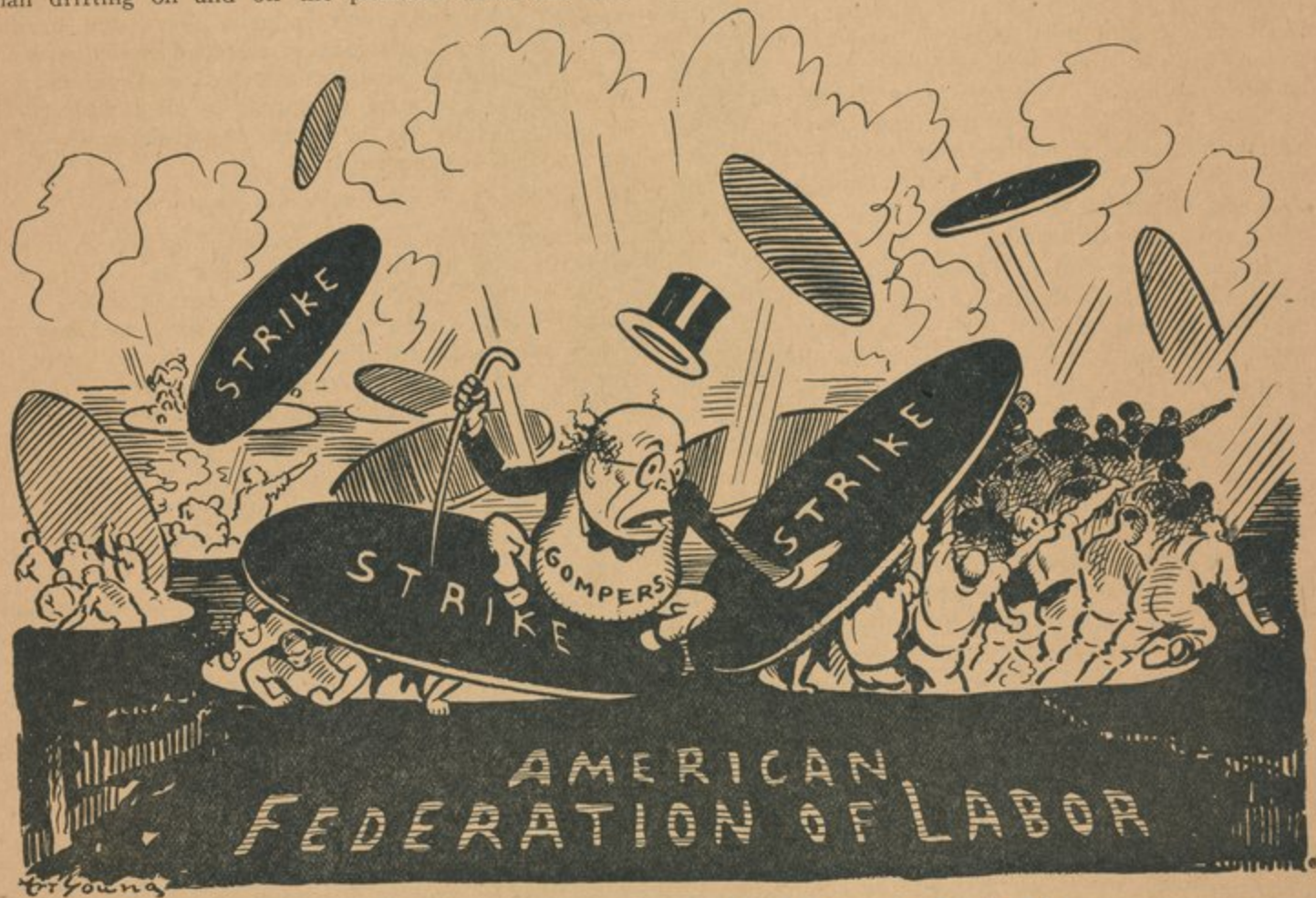
Samuel Gompers in His Favorite Role But There Are Too Many Lids to Sit On