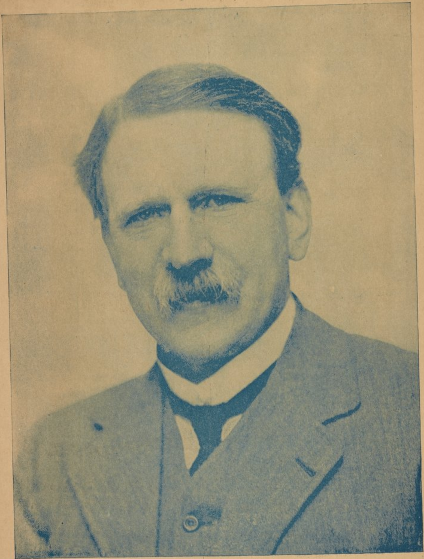
Robert Smillie, the Miners' Leader

His Message to American Labor is Printed in this Issue