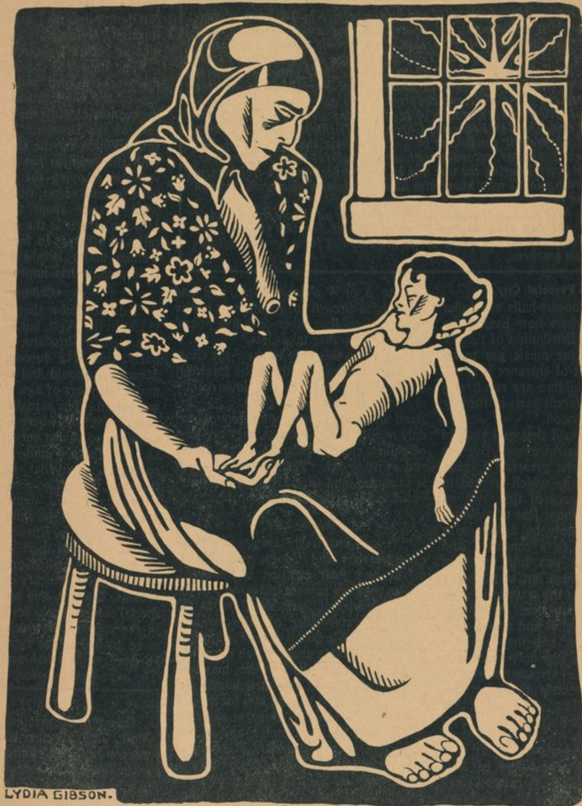
Christmas in Europe, 1919