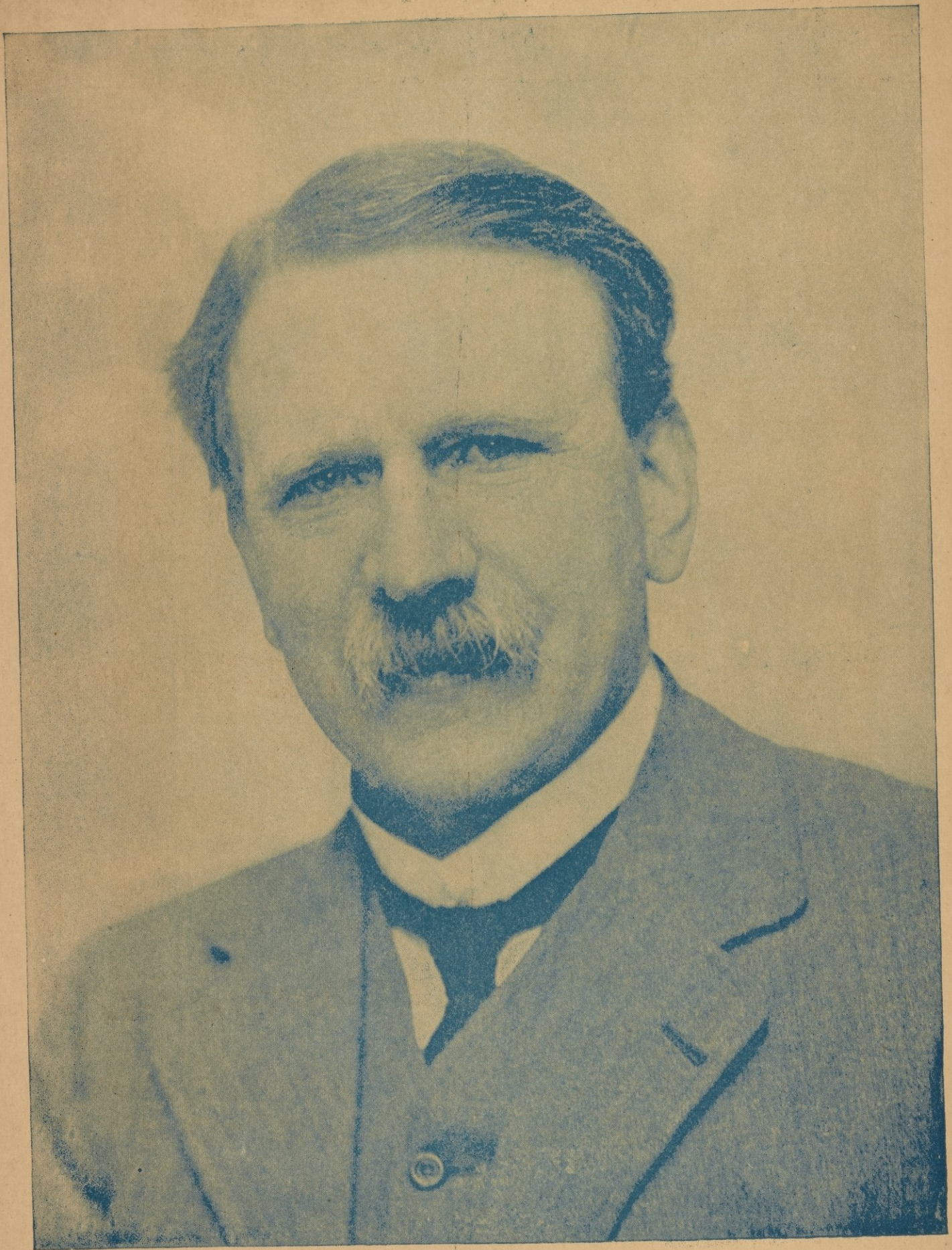
Robert Smillie, the Miners' Leader

His Message to American Labor is Printed in this Issue