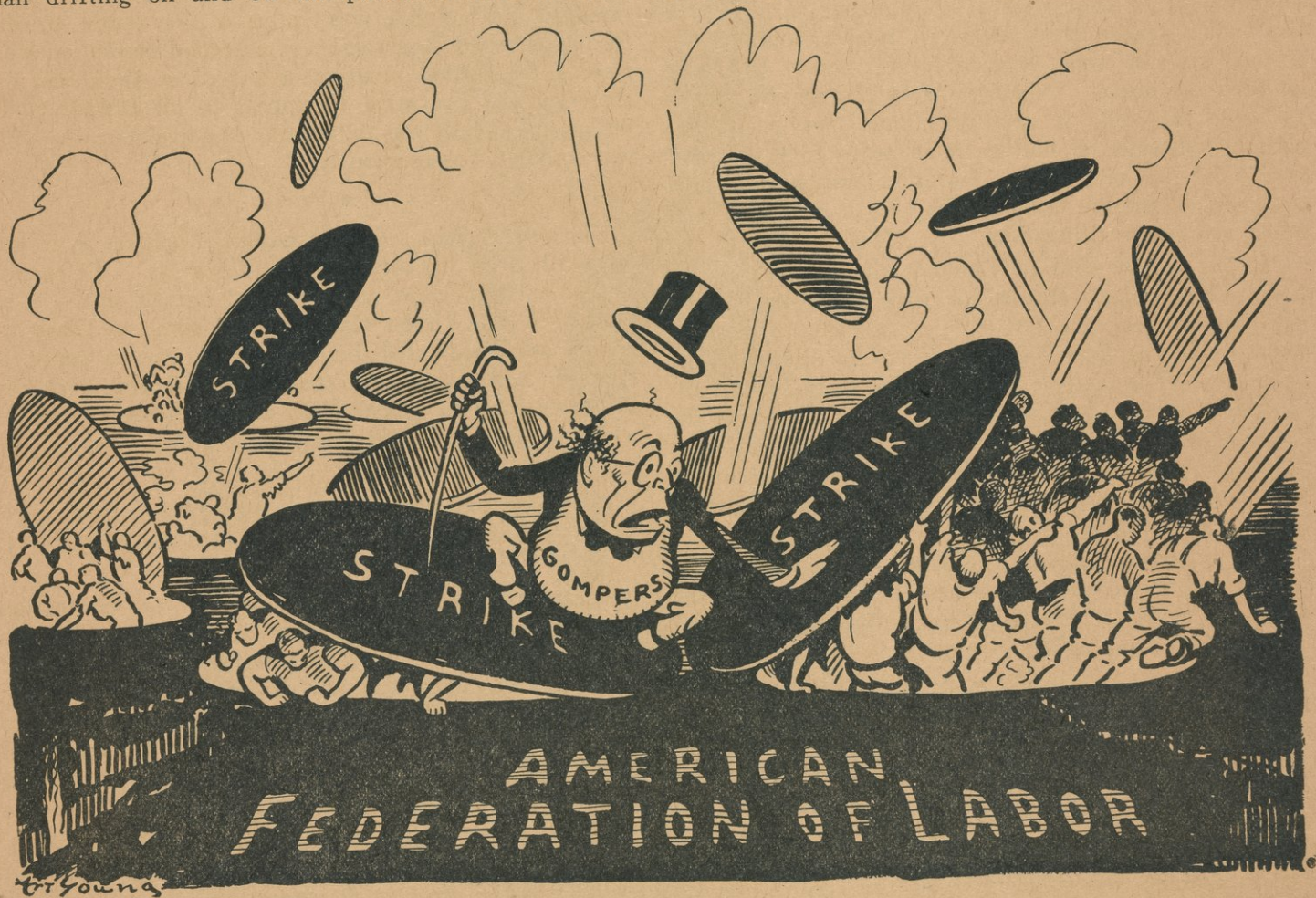
Samuel Gompers in His Favorite Role But There Are Too Many Lids to Sit On