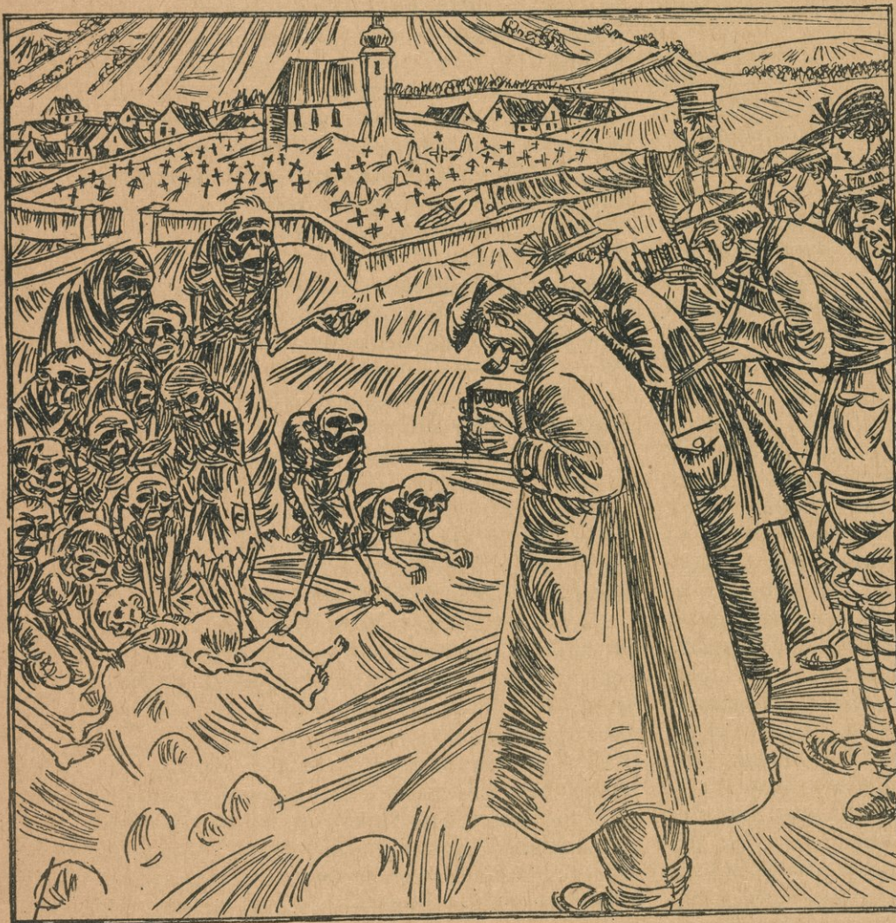
Tourists Seeing the Sights in Germany

Past the parked motor lorries we walked up the main street. A car full of Y. M. C. A. girls and men in uniform came by. "Kee-kee-kee"—"Giggle-giggle."