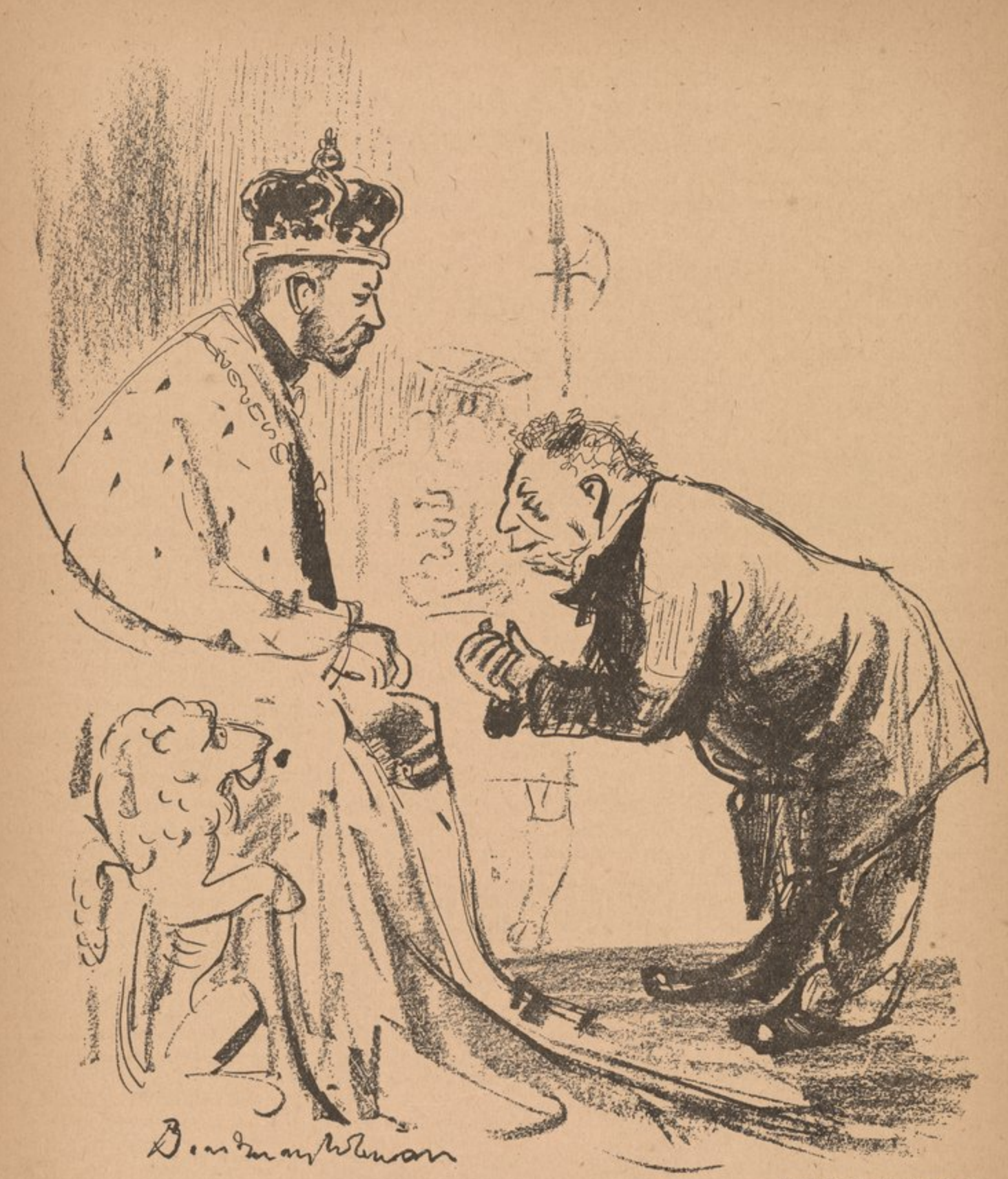
Drawn by Boardman Robinson