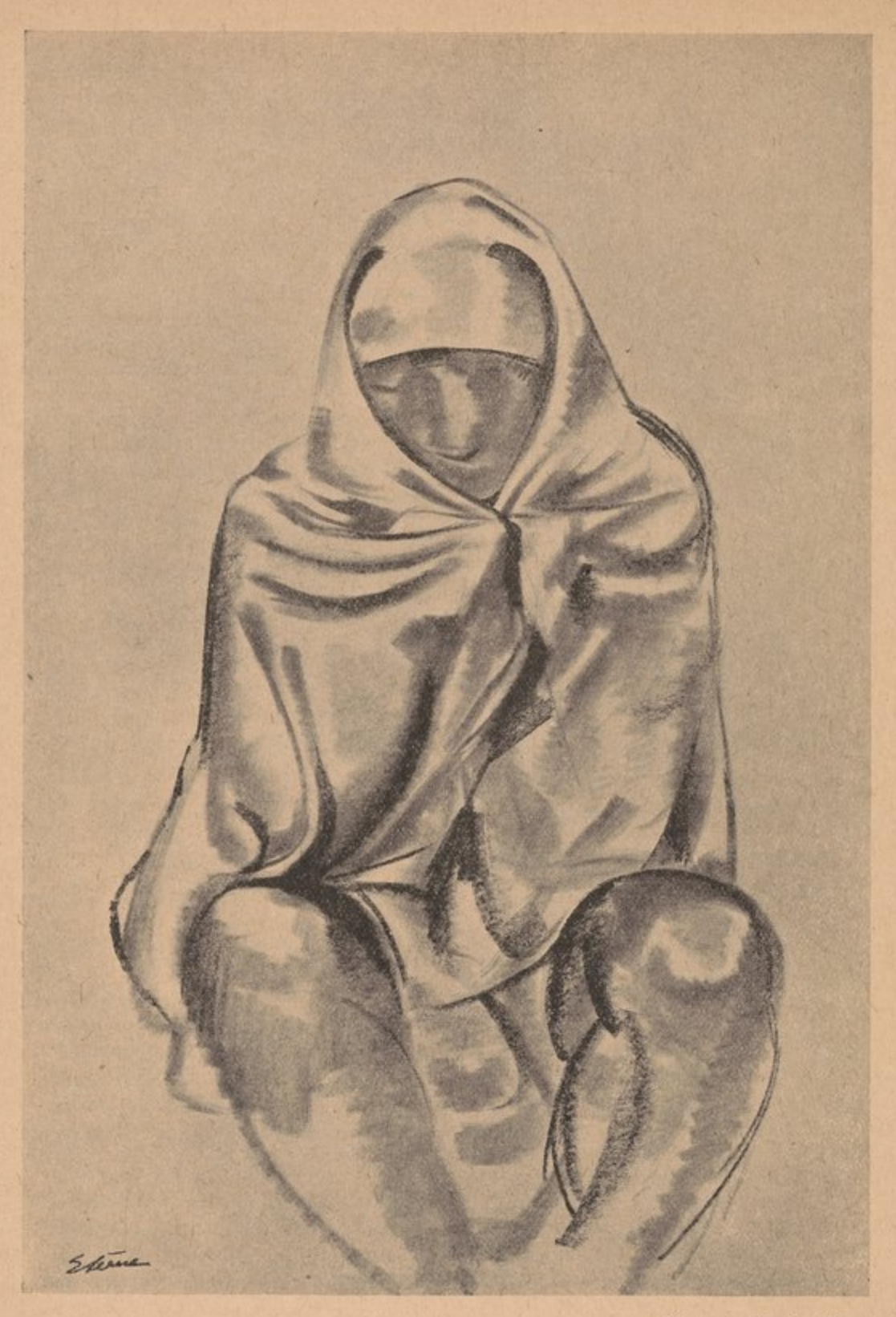
A Pueblo Indian