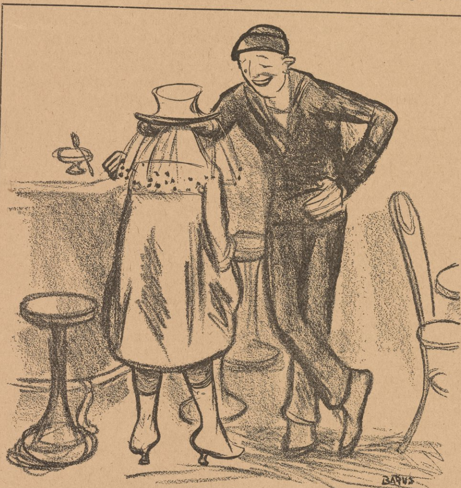
"Don't you believe that stuff about a sailor having a sweetheart in every port!"

We can not overlook the fact that the working class movement in the United States on the whole, has remained at this time the most backward in the world. Of all the labor bodies in the world, the organized labor movement of the United States is the only one that has practically forgotten nothing and learned nothing from this great world catastrophe. The average organized worker is repeating the old slogans in the old way. But if we are to retain our place in the great fraternity of International Labor, if we are to do our share in the world reconstruction that is to fall to the task of organized labor, we must take up the task of regeneration, must give to the movement new inspiration, new ideals—call it to fight for the cause of Internationalism and economic liberty.