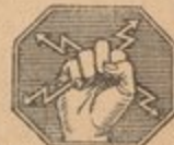
THE LIBERATOR 4-18