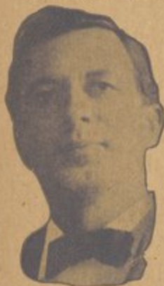
Brann, the Iconoclast

him. "Journalism's most Tragic and Pathetic Figure," Elbert Hubbard said of him. Brann was an iconoclast. He tore down the conventions of life—stripped off the cloak of hypocrisy and laid bare the blinding nakedness of TRUTH! Nothing could stop the fury of his attack. When he wrote or spoke, the artificial barriers of society tottered, the sham draperies of Virtue fell, and the false pretenses of love and marriage stood exposed in their shame. Sins of the World—Mysteries of Heaven and Hell—