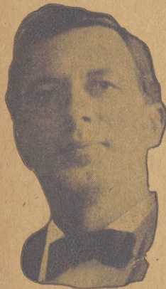
Brann, the Iconoclast

him. "Journalism's most Tragic and Pathetic Figure," Elbert Hubbard said of him. Brann was an iconoclast. He tore down the conventions of life—stripped off the cloak of hypocrisy and laid bare the blinding nakedness of TRUTH! Nothing could stop the fury of his attack. When he wrote or spoke, the artificial barriers of society tottered, the sham draperies of Virtue fell, and the false pretenses of love and marriage stood exposed in their shame. Sins of the World—Mysteries of Heaven and Hell—