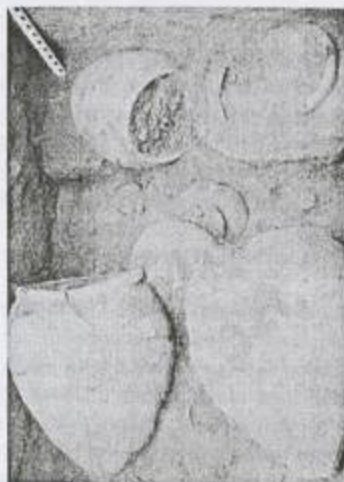
Details of Meg-I (after K.Rajan)