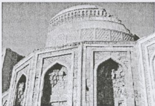
Mausoleum of Turabek-Khanum (1370 ACE)