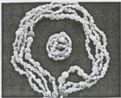
Etched carnelian beads, Meg IV