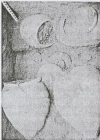
Details of Meg-I (after K.Rajan)