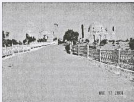
Mausoleums of renowned sufi saint Najam-ad-Din al-Kubra (left) built in early 14 th century and Sultan Ali of 16 th century