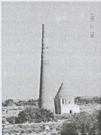
60-meter high Kultug-Timur minaret (11 th – 14 th centuries) is the highest of all the minarets built in Central Asia.