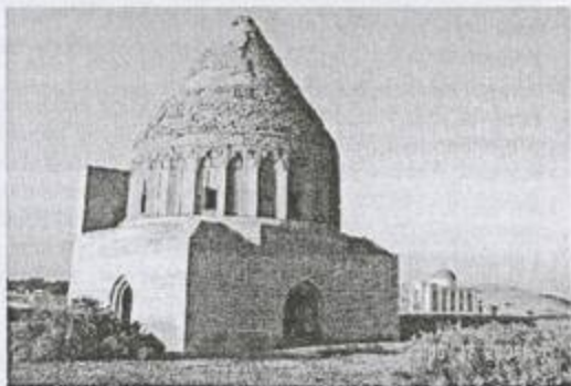
Mausoleum of Sultan Tekesh marked by conical cupola decorated with glazed tiles (12 – 13 th centuries ACE)