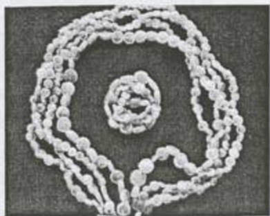
Etched carnelian beads, Meg IV