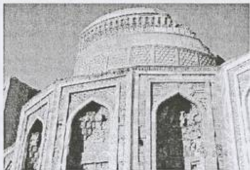
Mausoleum of Turabek-Khanum (1370 ACE)