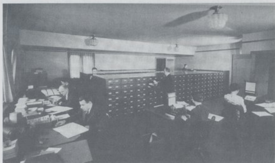
FIGURE 3. The Dictionary Room in the 1930s.