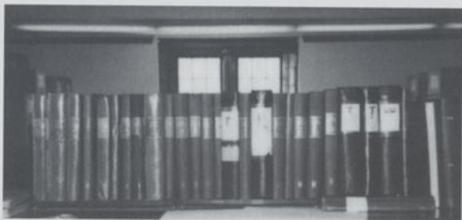
FIGURE 1. A set of the CAD (published volumes and volumes in proofs).

It is the CAD's re-emergence from slumber under Gelb and its subsequent fate, with which my own life and career became inextricably embroiled, that the following account deals with. It is a personal history, which takes its significance not from the narrator's life and person but from the extraordinary individuals who were the players and from the import of the project that they strove to complete, a project that was dubbed by one of its most important participants "an adventure of great dimension." 10