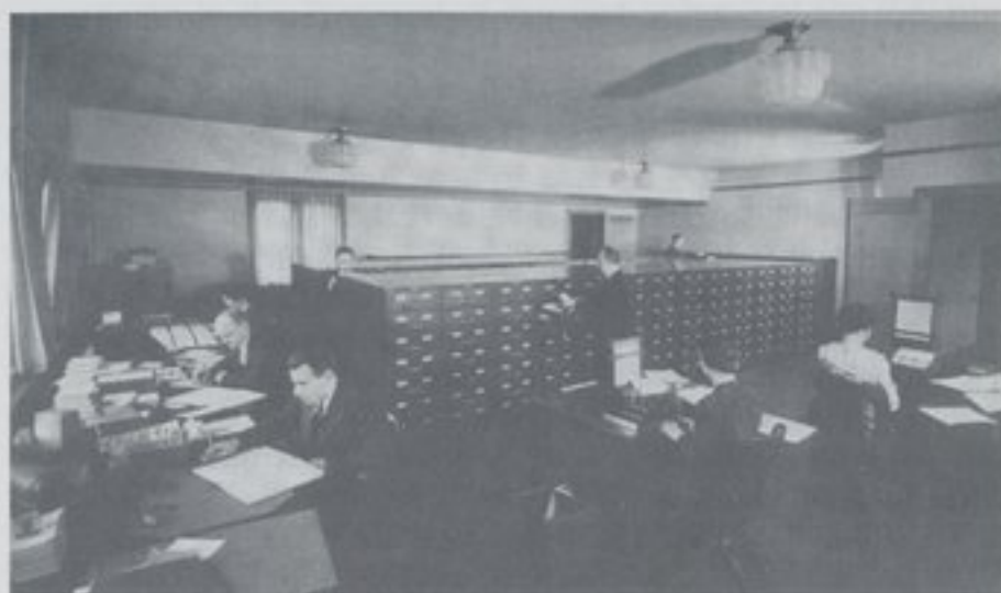
FIGURE 3. The Dictionary Room in the 1930s.