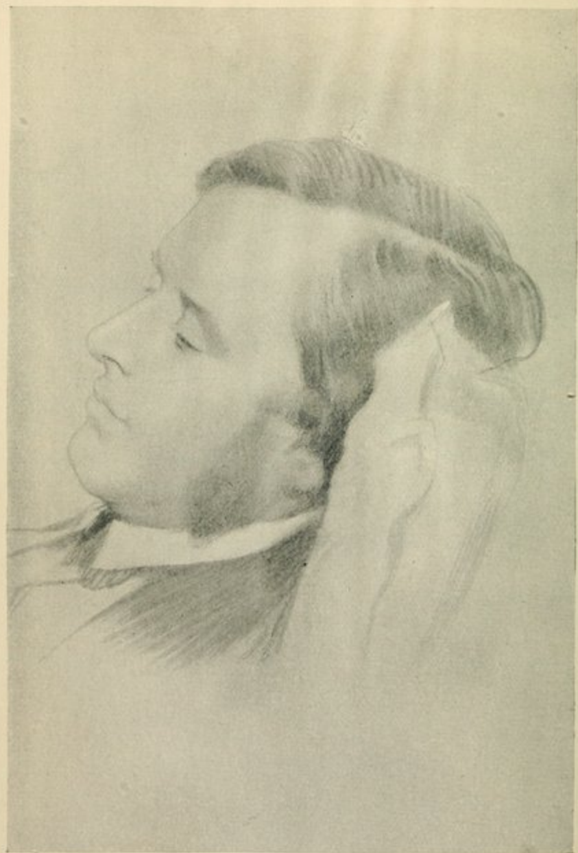
SIR ALEXANDER DUFF GORDON.