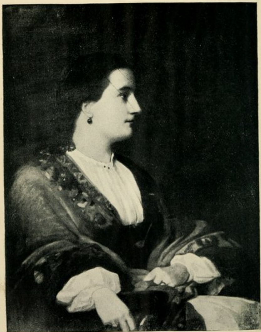
LADY DUFF GORDON.