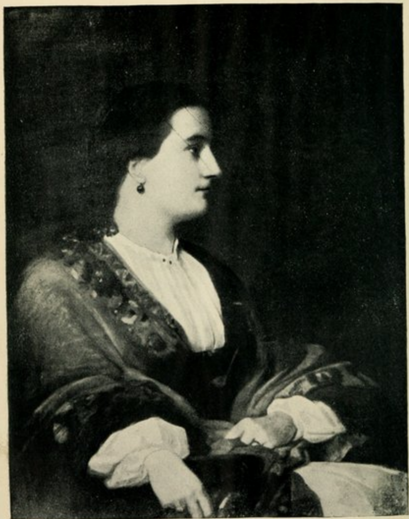
LADY DUFF GORDON.